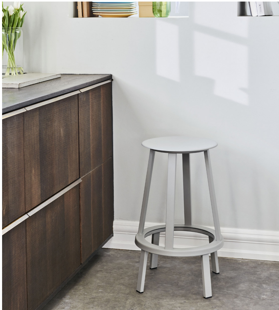
Revolver Bar Stool | Sky grey powder coated steel