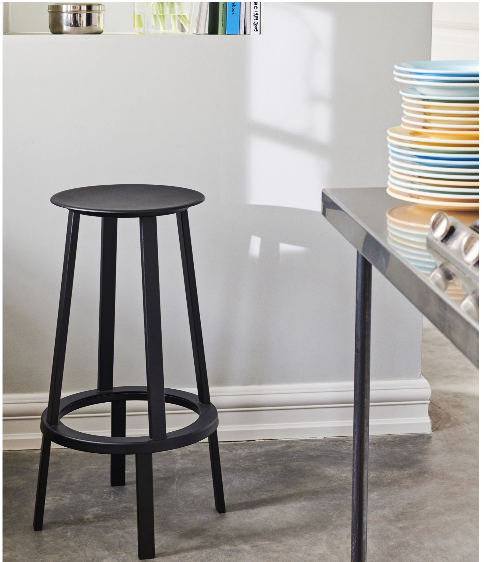
Revolver Bar Stool | Black powder coated steel