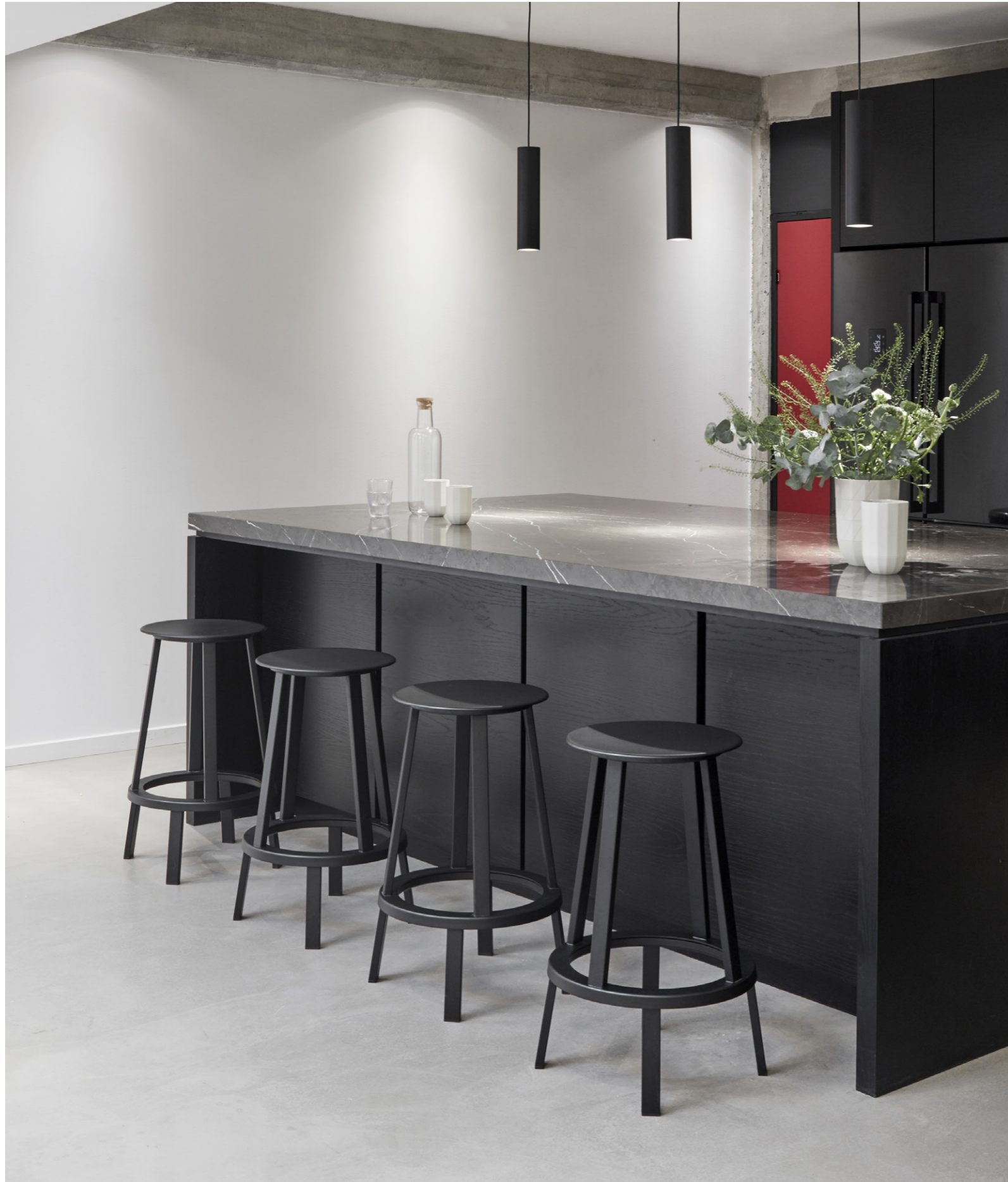
Revolver Bar Stool | Black powder coated steel