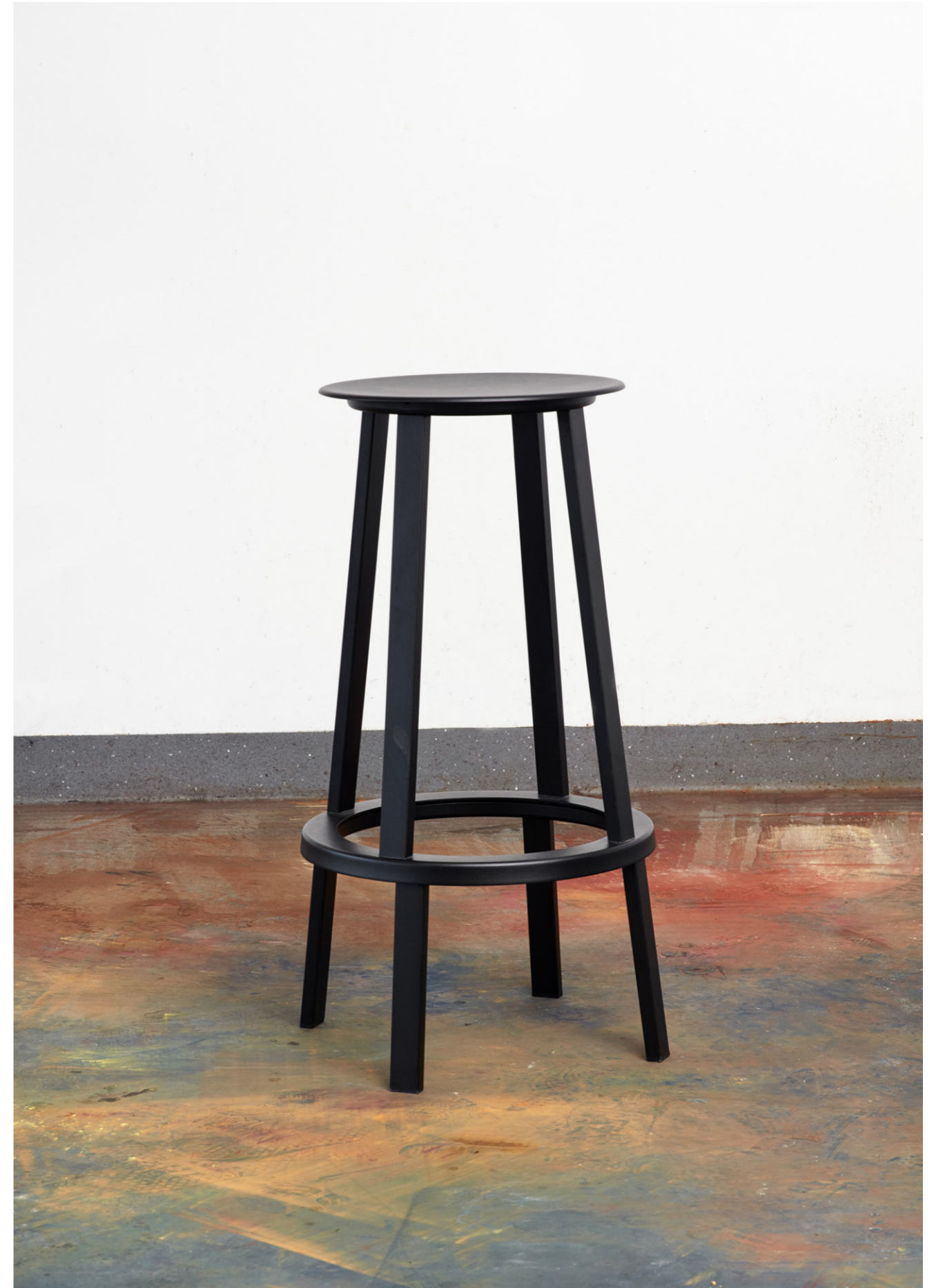
Revolver Bar Stool | Black powder coated steel