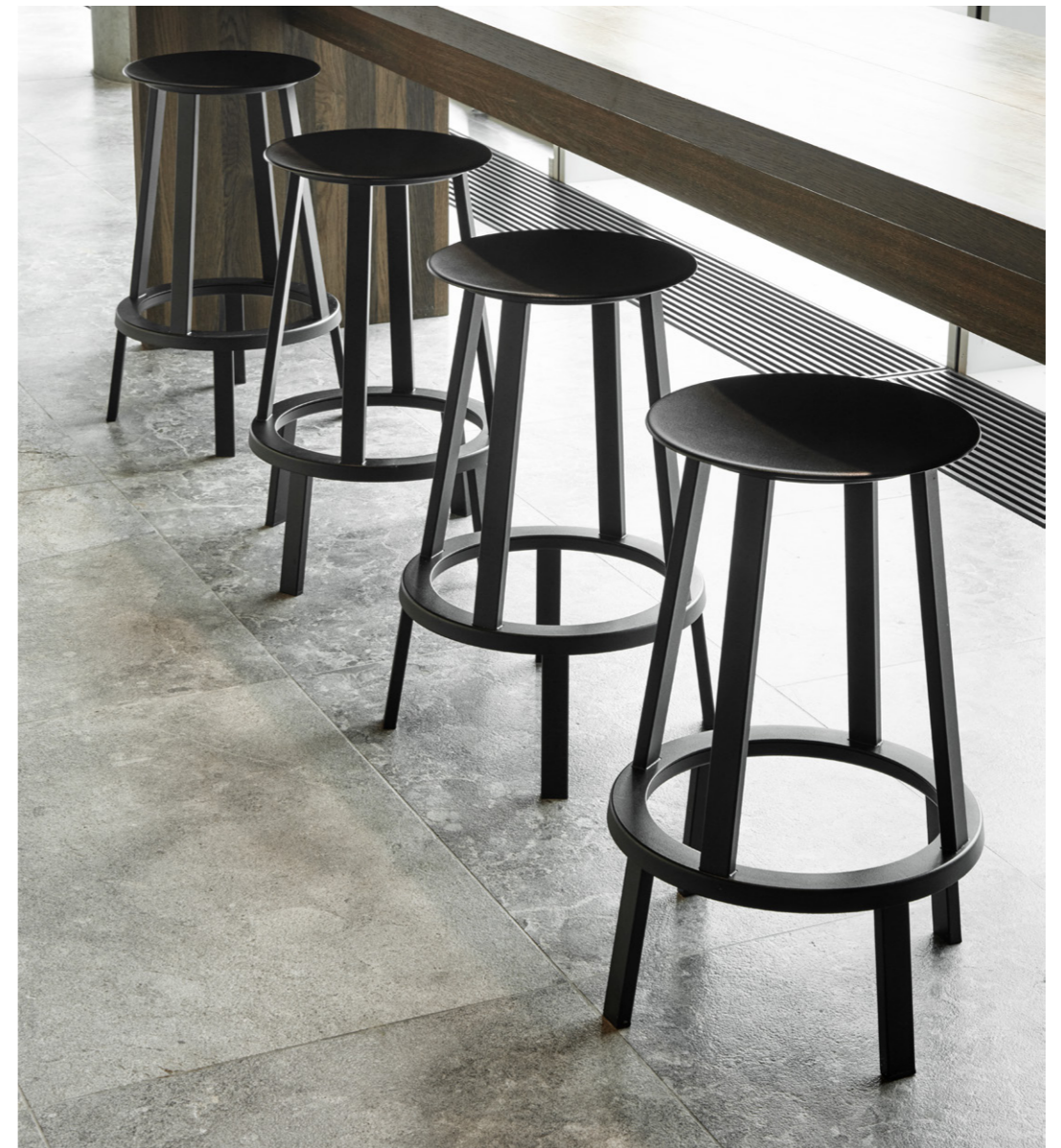
Revolver Bar Stool | Black powder coated steel