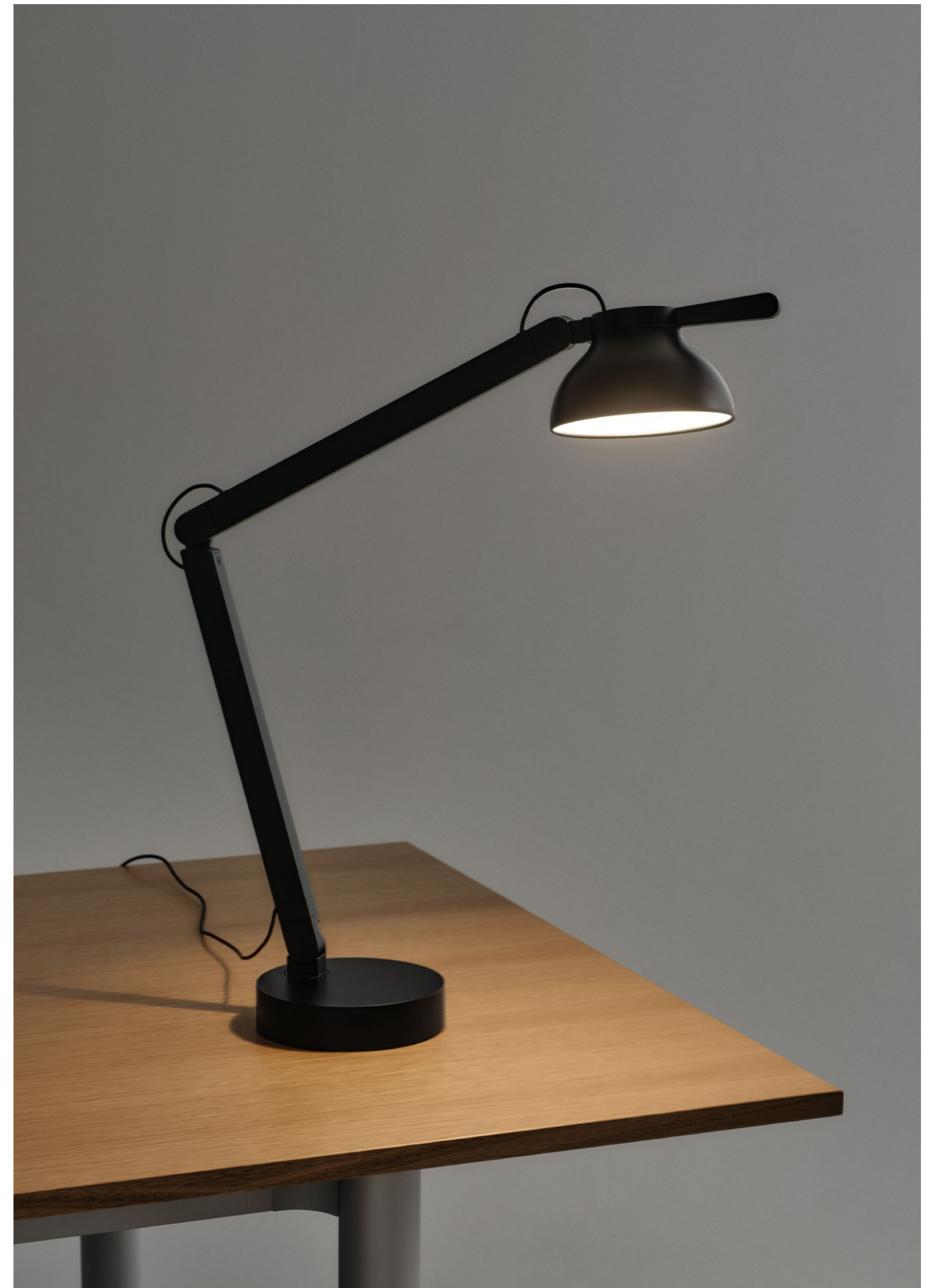
PC Desk Lamp | Soft black