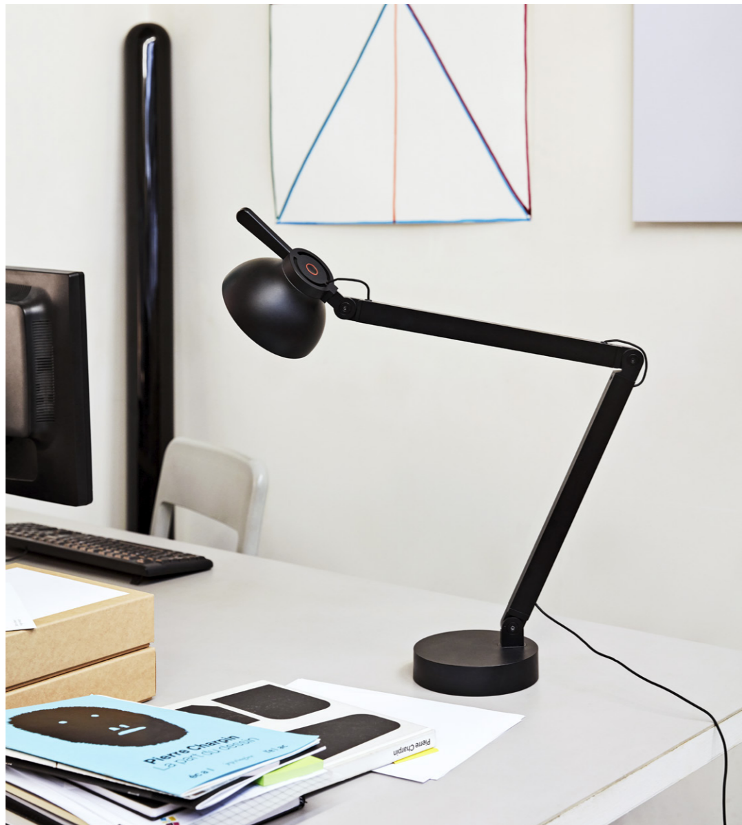
PC Desk Lamp | Soft black