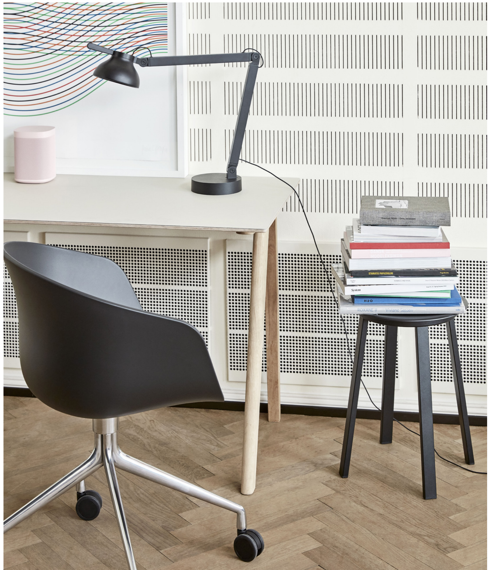
PC Desk Lamp | Soft black