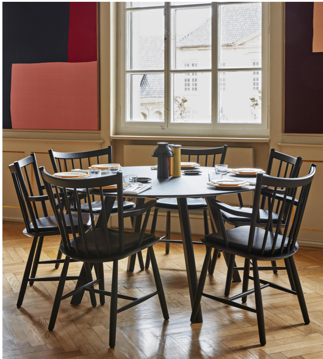
J42 Chair | Black water-based lacquered oak