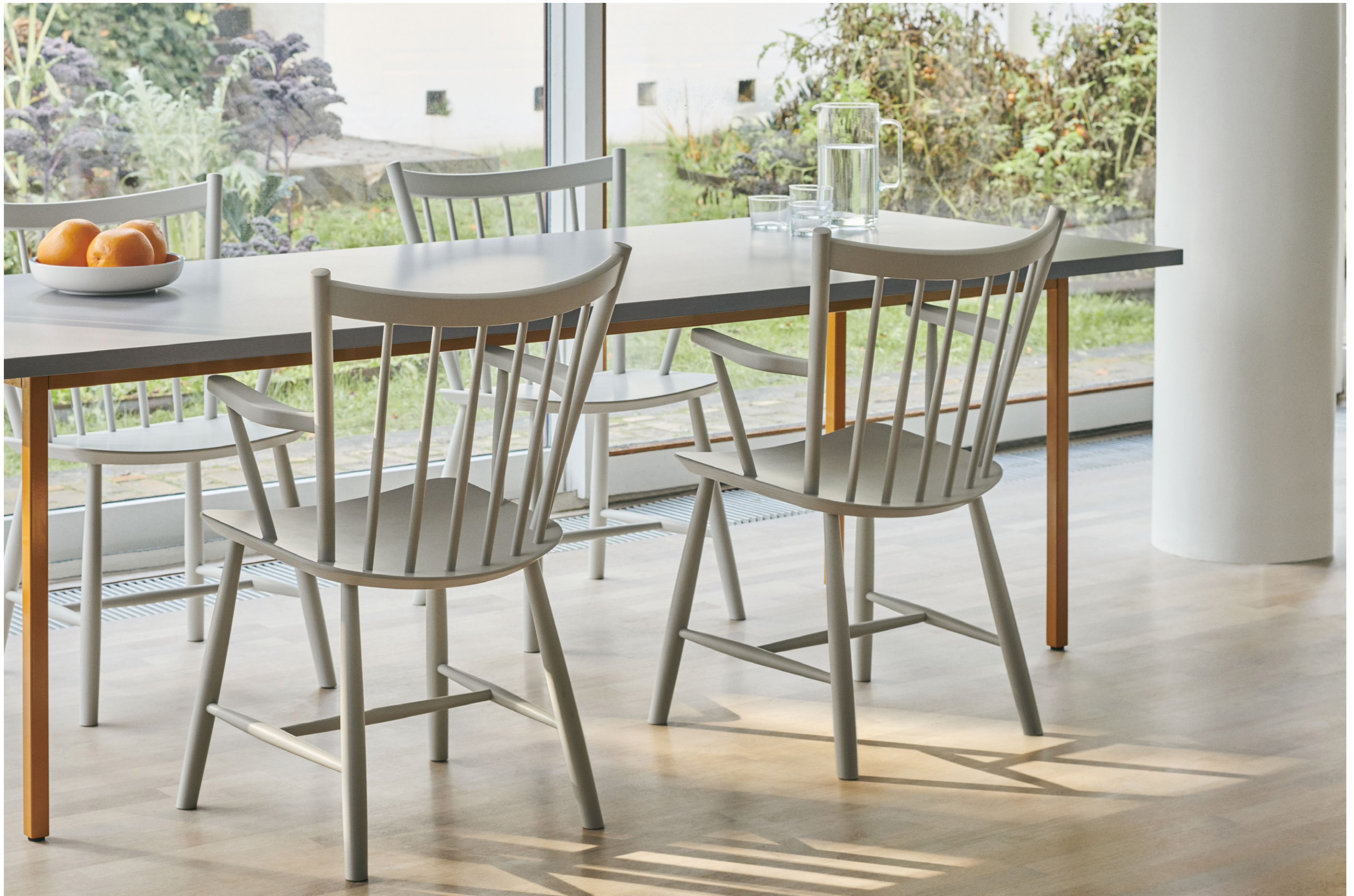
J42 Chair | Warm grey water-based lacquered beech