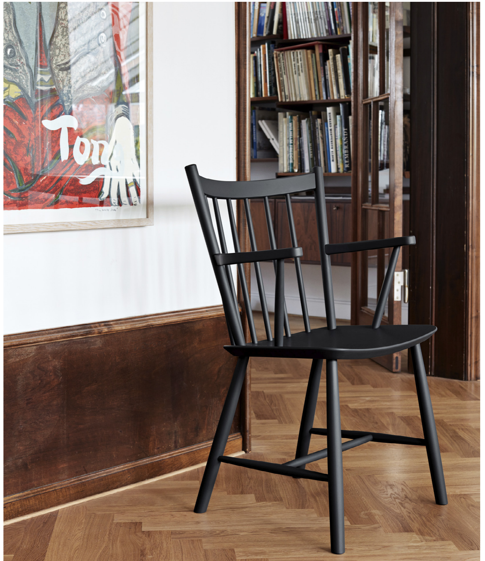
J42 Chair | Black water-based lacquered oak