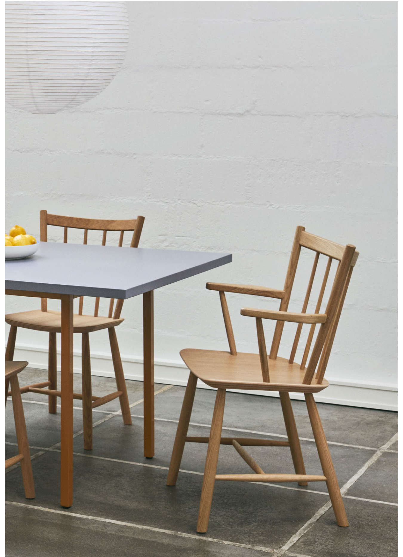
J42 Chair | Water-based lacquered oak

Børge Mogensen (1914 – 1972) is known as one of the great Danish designers of the twentieth century for his quality furniture and strong, minimalist designs. Characterised by simple, solid lines and durable construction, his clean aesthetics and precise proportions embody Danish modernism. Having initially trained as a cabinet-maker before studying furniture design at the Danish School of Arts and Crafts, Børge Mogensen later studied architecture at The Royal Danish Academy of Fine Arts. He later became design director at the Danish Co-Operative Society, FDB, where he focused on creating well-designed, functional furniture that could be industrially produced for the general public. HAY has recreated Børge Mogensen's timeless J41 and J42 chairs, which were part of the J-Series he designed during his time at FDB.