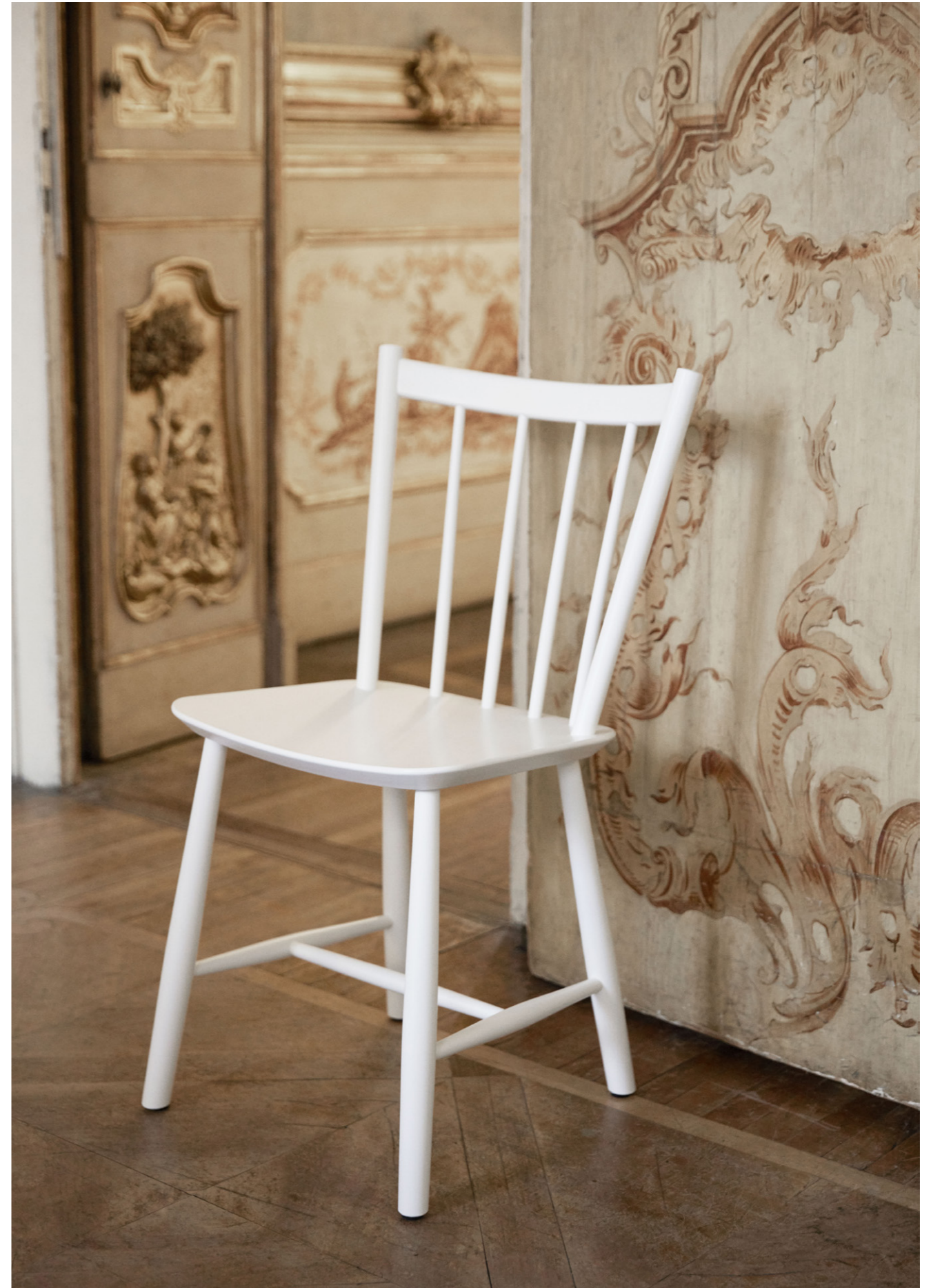
J41 Chair | White water-based lacquered beech

Børge Mogensen (1914 – 1972) is known as one of the great Danish designers of the twentieth century for his quality furniture and strong, minimalist designs. Characterised by simple, solid lines and durable construction, his clean aesthetics and precise proportions embody Danish modernism. Having initially trained as a cabinet-maker before studying furniture design at the Danish School of Arts and Crafts, Børge Mogensen later studied architecture at The Royal Danish Academy of Fine Arts. He later became design director at the Danish Co-Operative Society, FDB, where he focused on creating well-designed, functional furniture that could be industrially produced for the general public. HAY has recreated Børge Mogensen's timeless J41 and J42 chairs, which were part of the J-Series he designed during his time at FDB.