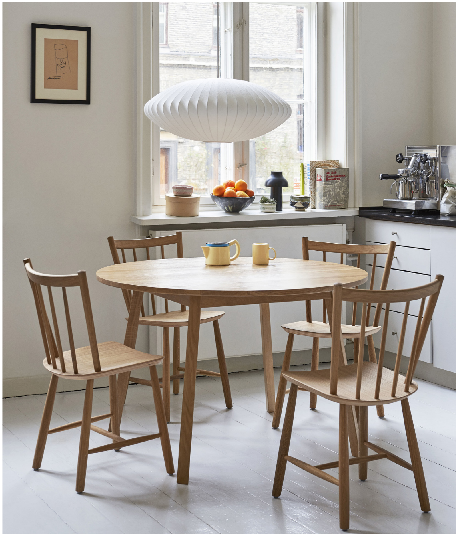
J41 Chair | Water-based lacquered oak