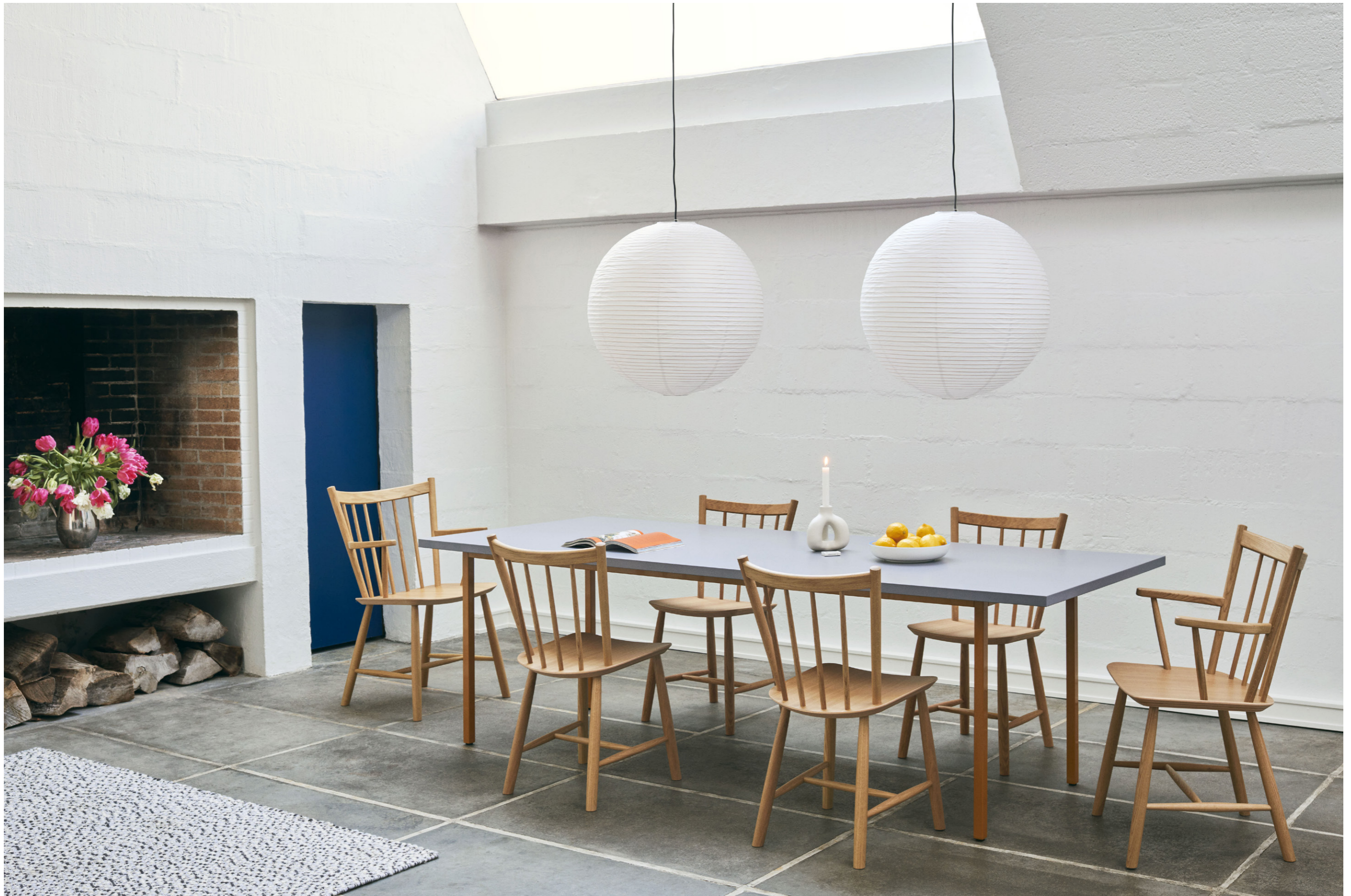
J41 Chair | Water-based lacquered oak