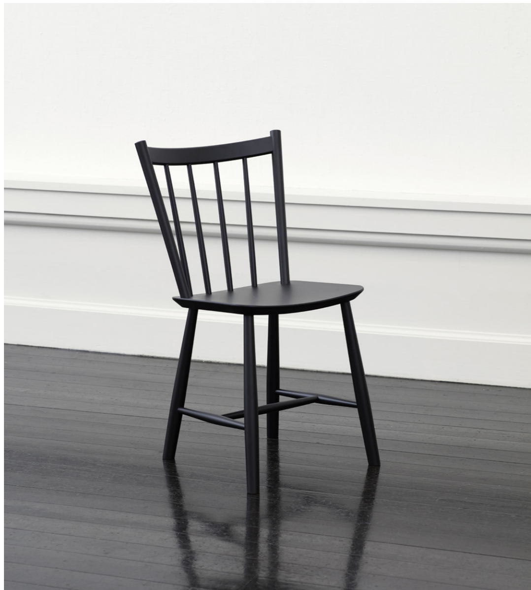
J41 Chair | Black water-based lacquered beech