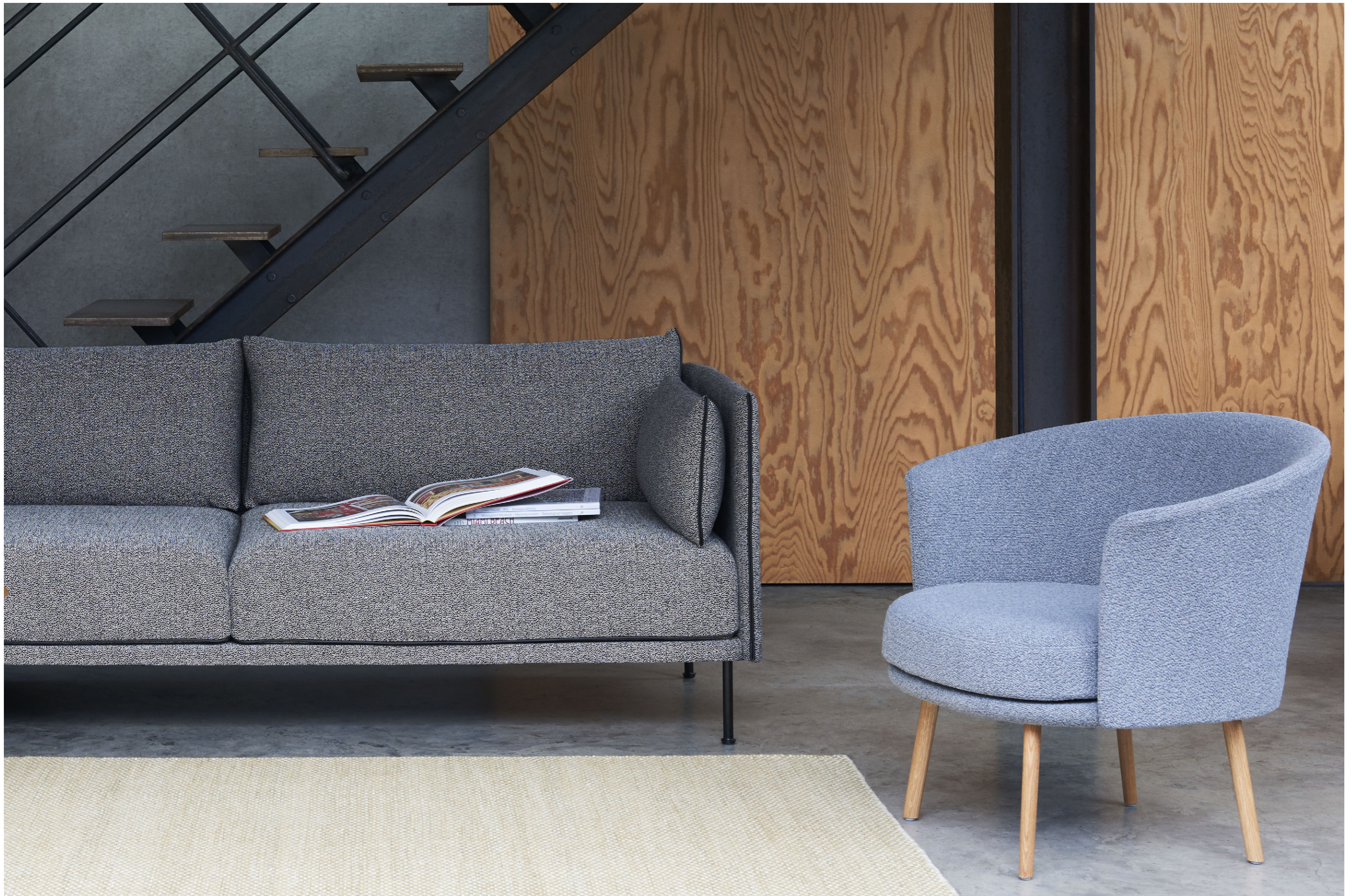
Dorso | Vidar 133 | Oiled oak base