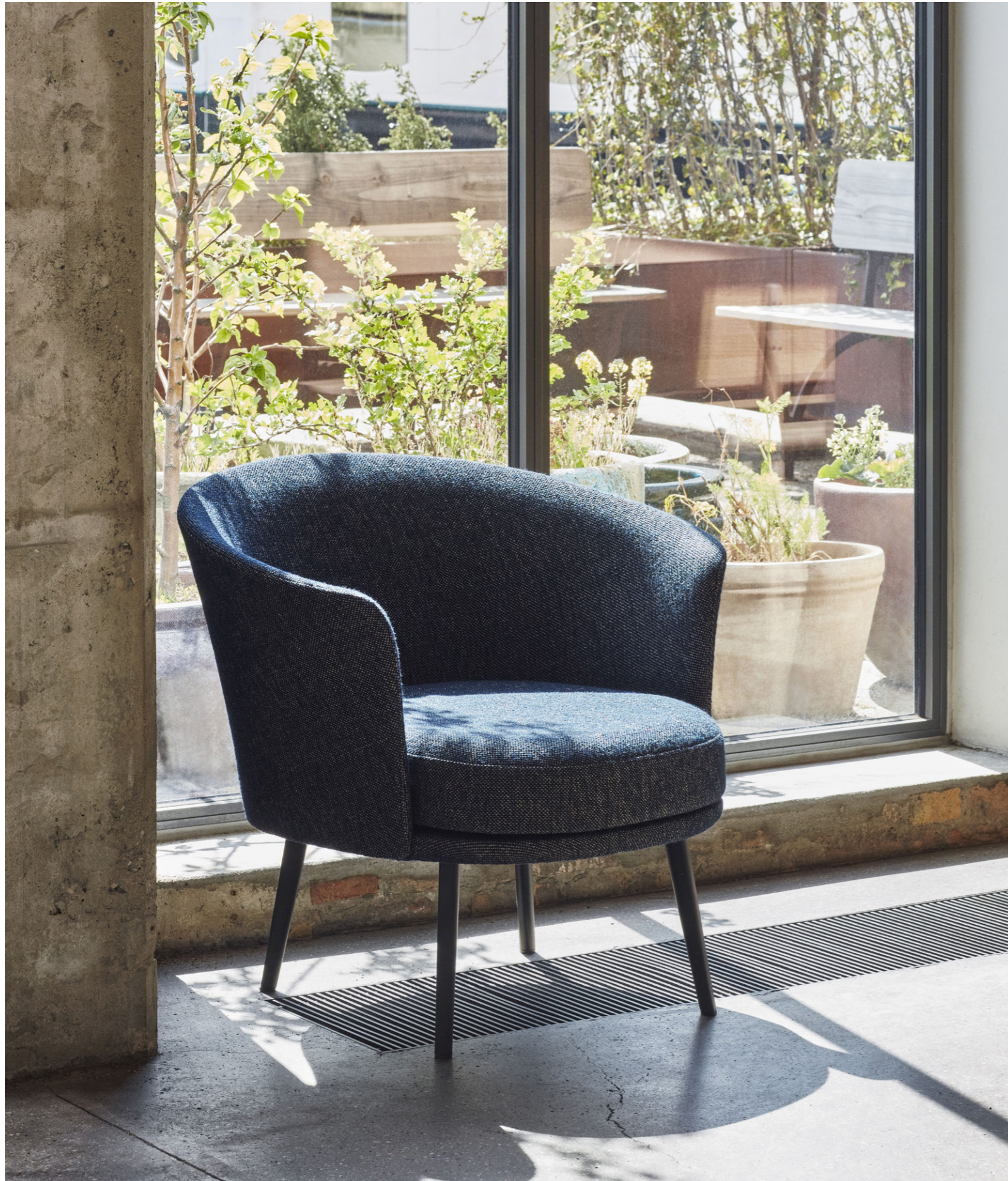
Dorso | Fairway Dark Blue 308-288 | Black powder coated steel base