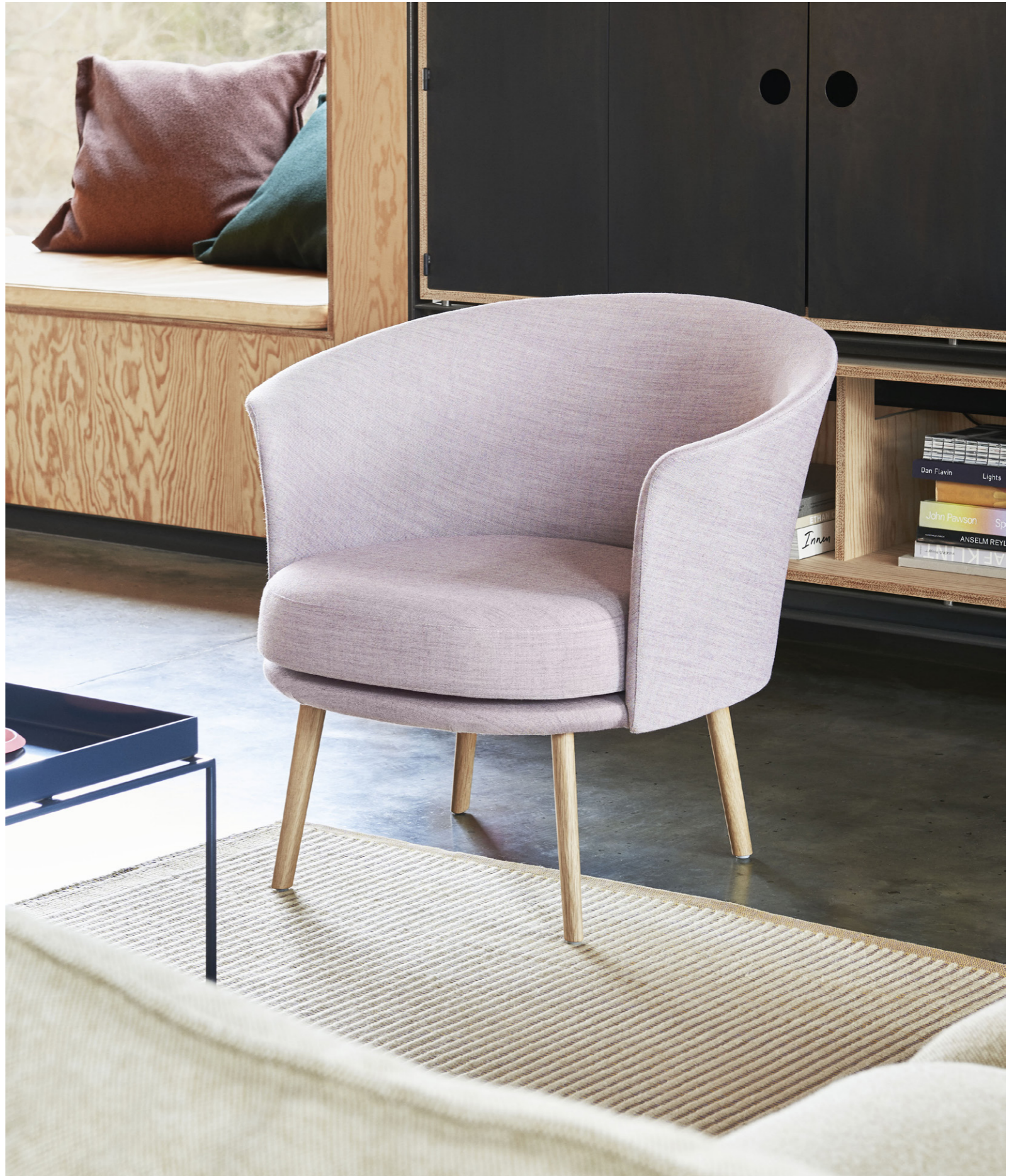
Dorso | Remix 682 | Oiled oak base