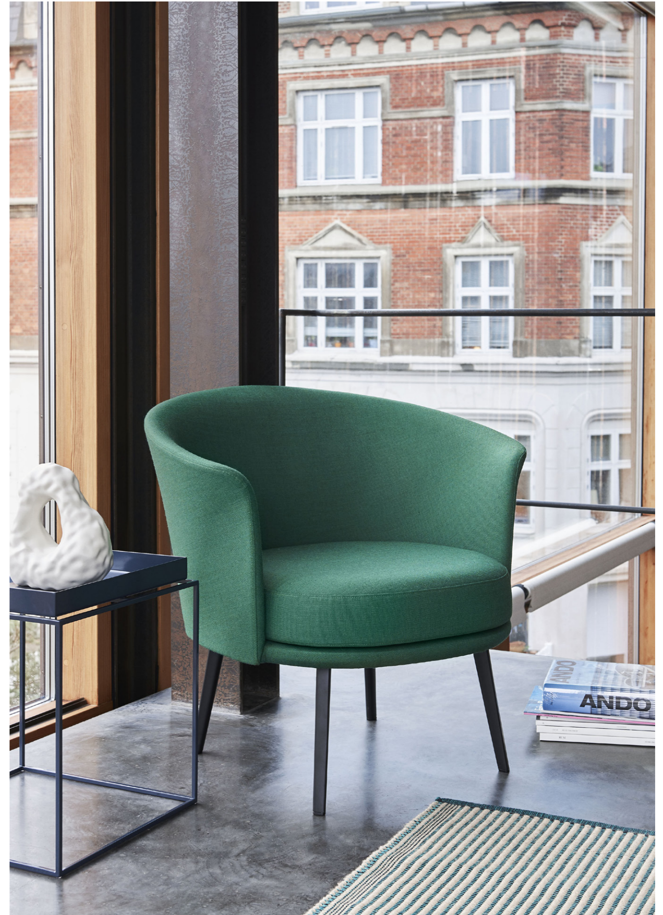
Dorso | Canvas 946 | Black powder coated steel base