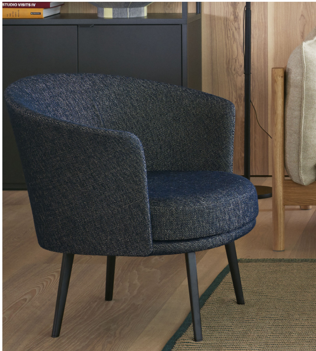
Dorso | Fairway Dark Blue 308-288 | Black powder coated steel base