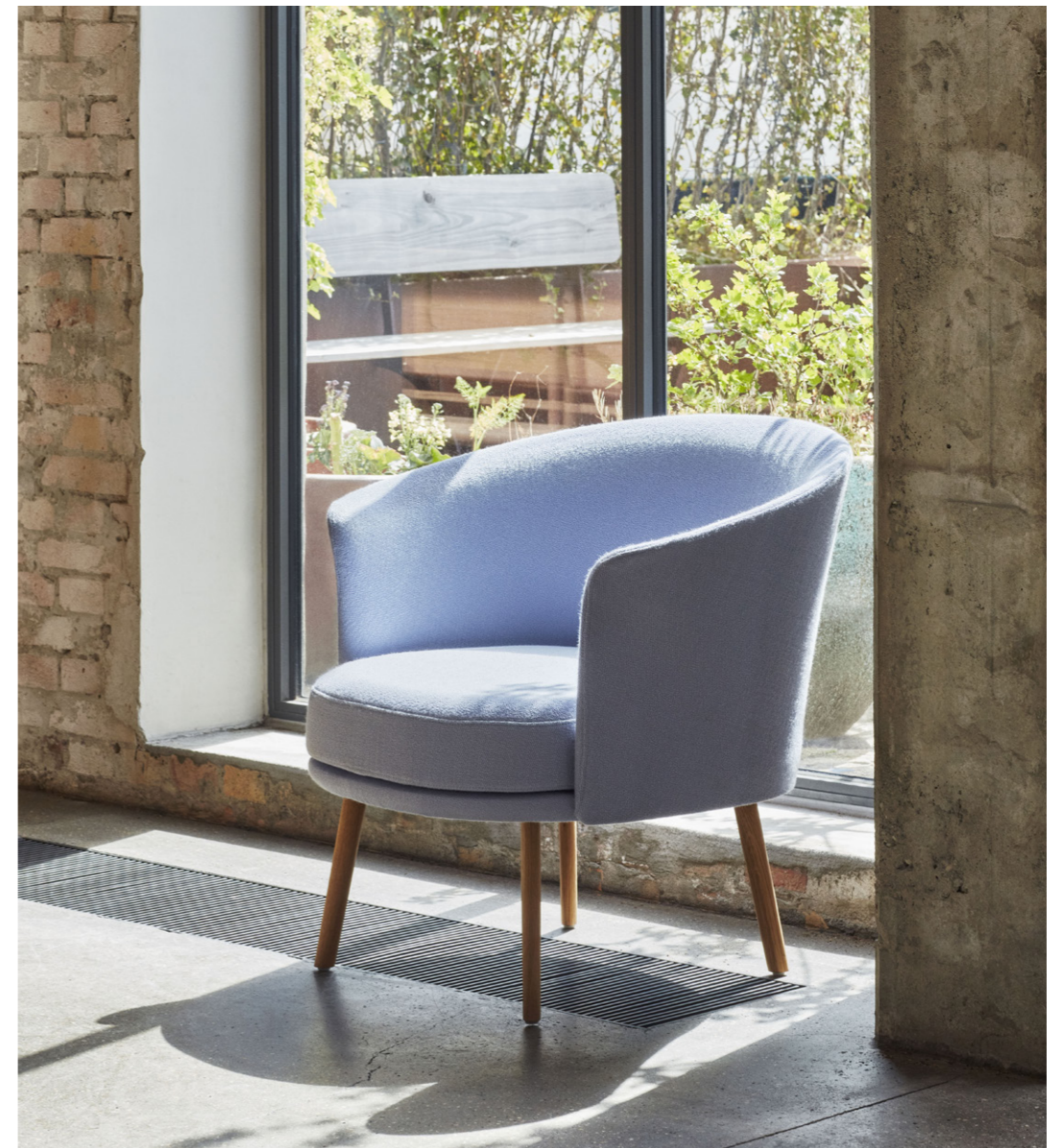
Dorso | Vidar 133 | Oiled oak base