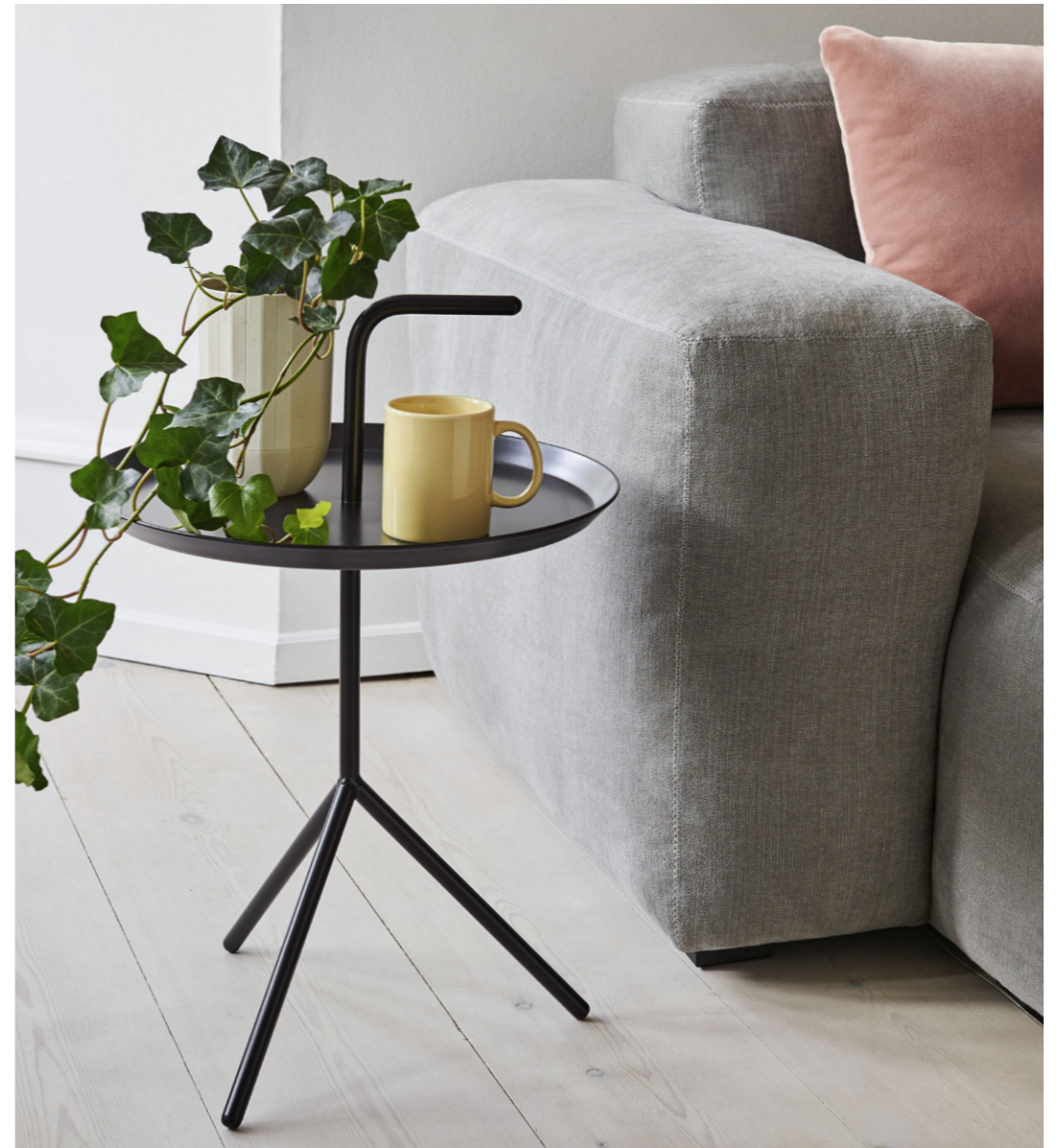
DLM | Black