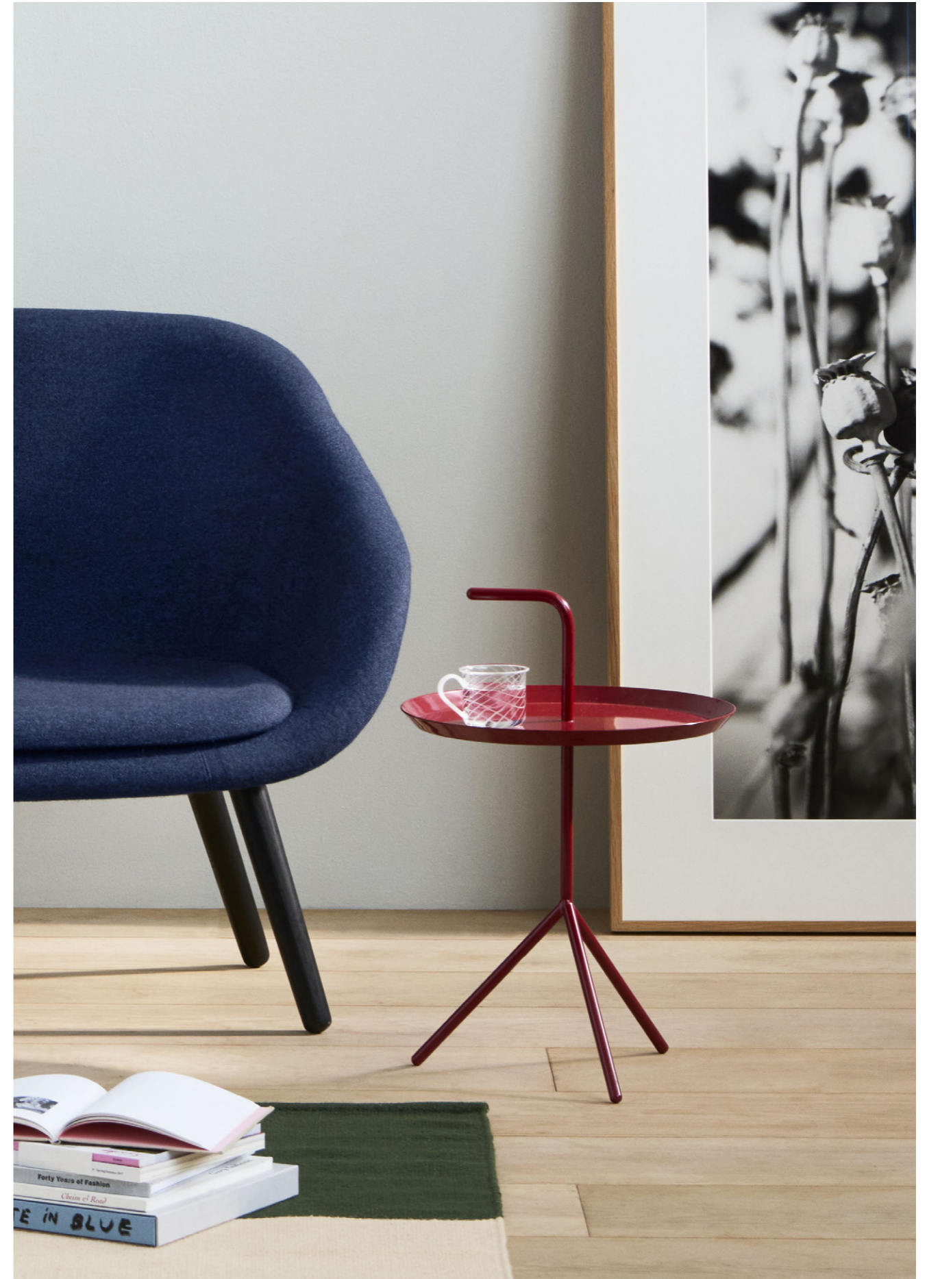
DLM | Cherry red high gloss