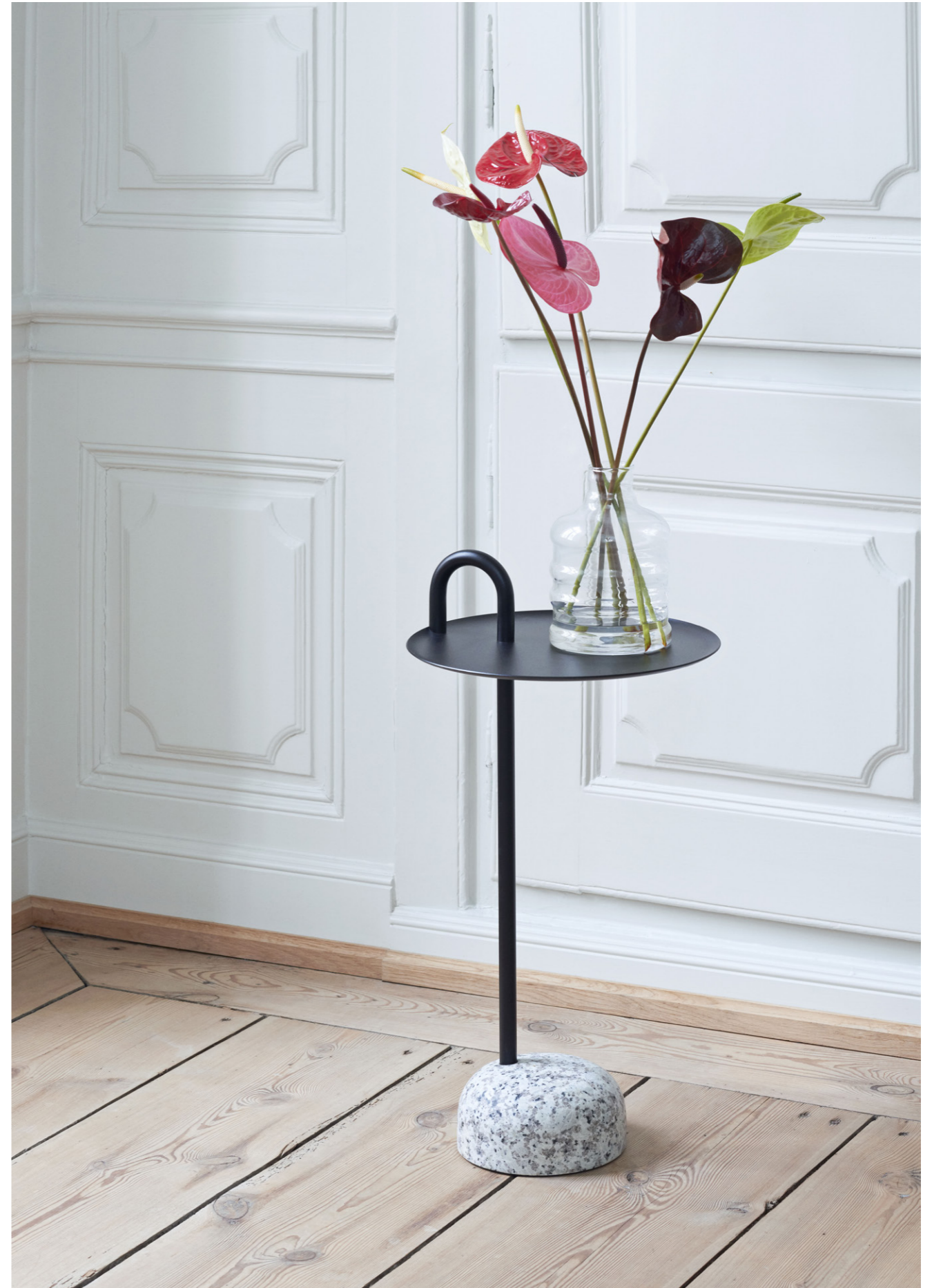
Bowler | Black