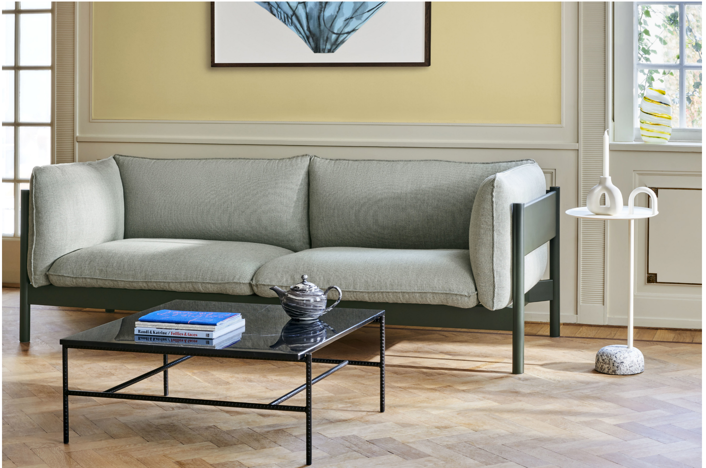
Bowler | White