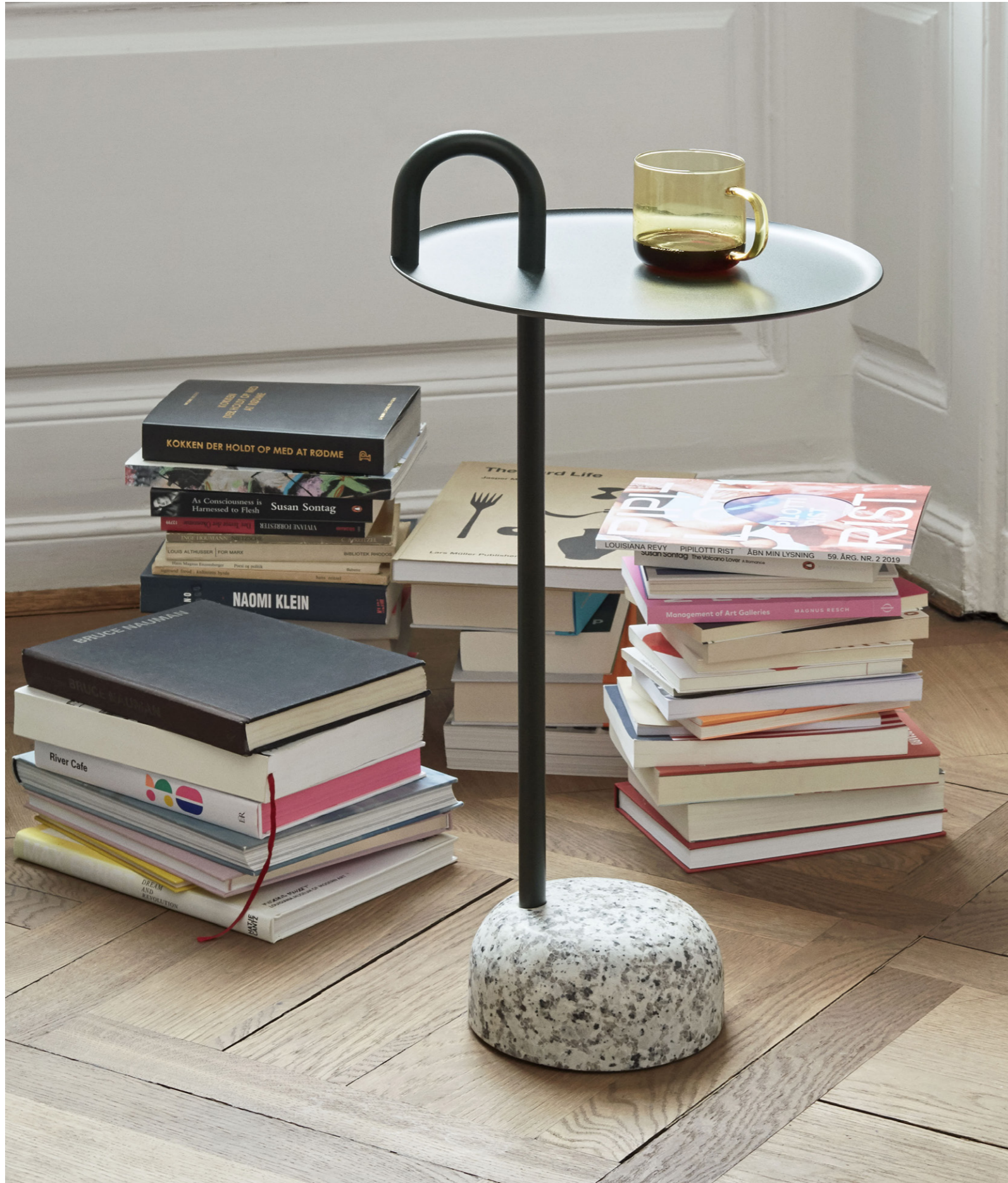
Bowler | Fir green