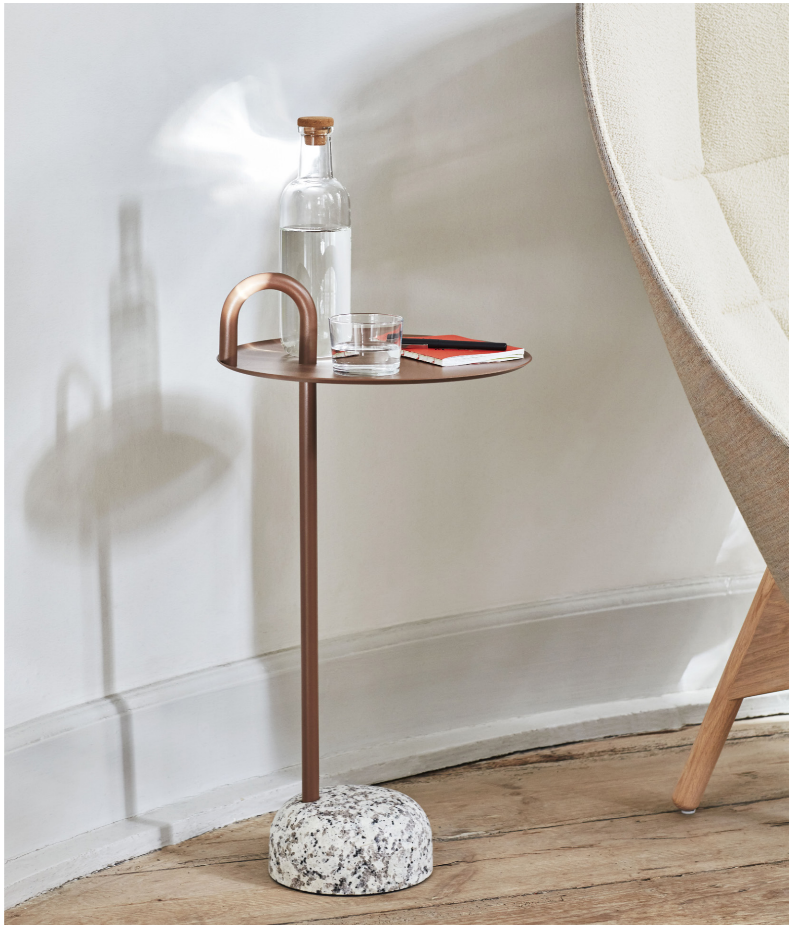
Bowler | Pale brown