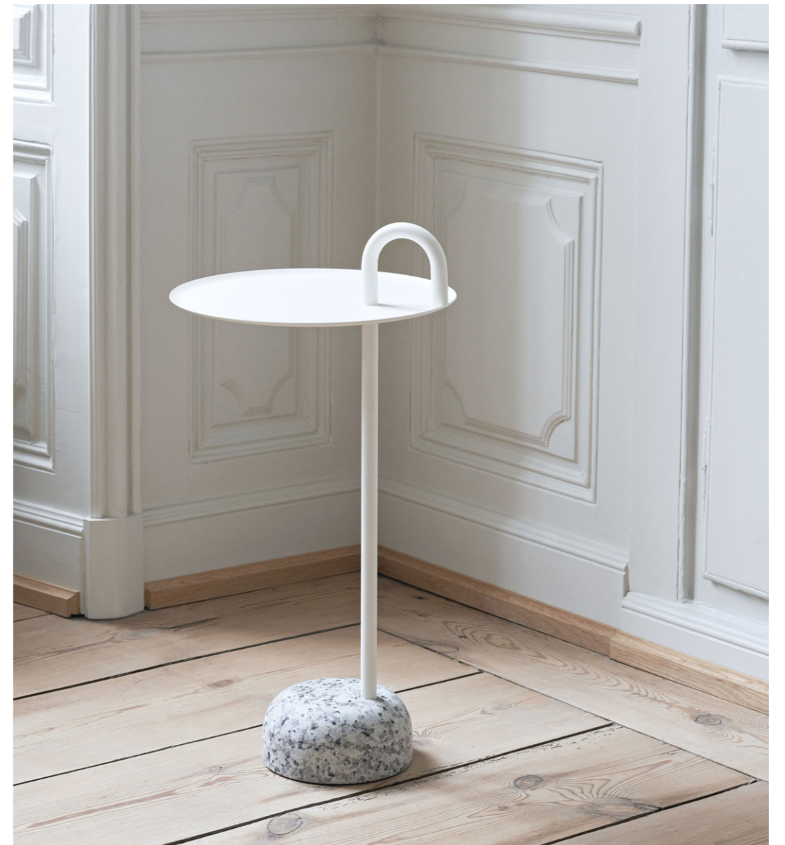
Bowler | Cream white