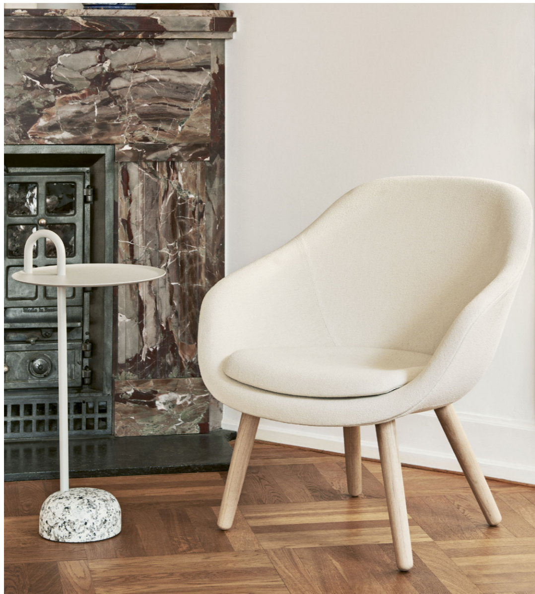
Bowler | Cream white