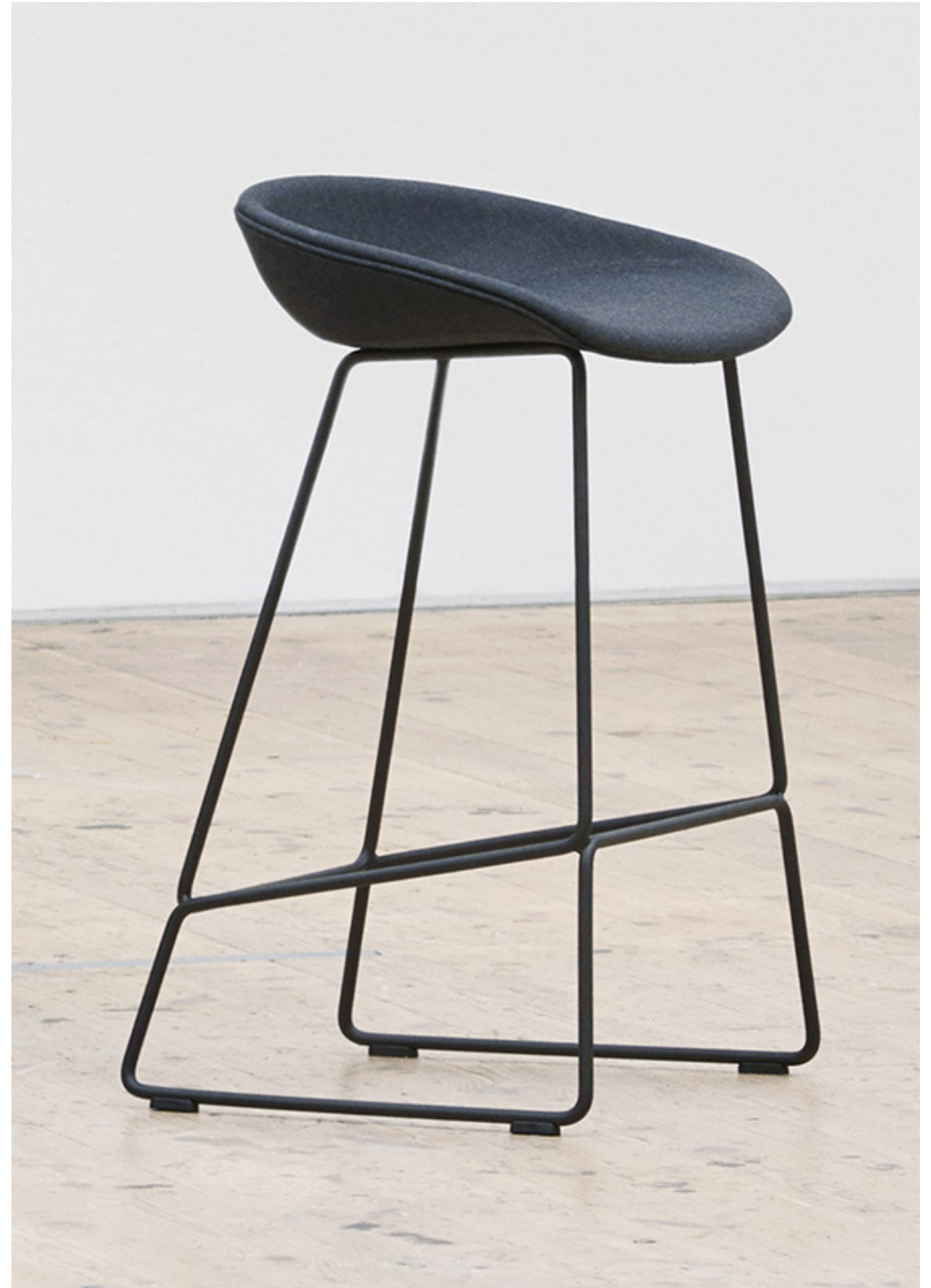
AAS 39 | Remix 183 | Black powder coated steel base