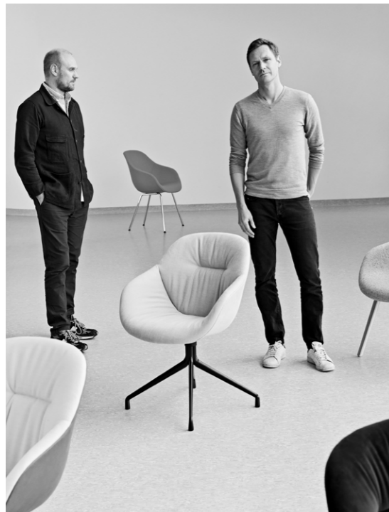
Hee Welling & HAY

Featuring a curved backrest and elegant rounded frame in metal, About A Stool AAS 39 offers a more industrial expression, while sharing the same versatile profile as the other designs in the collection. The upholstered seat is offered in a wide variety of fabric options, with the sled base available in two heights in different steel finishes. The series' simple yet strong visual presence makes it ideal as a bar stool in a variety of corporate, public, and private contexts.