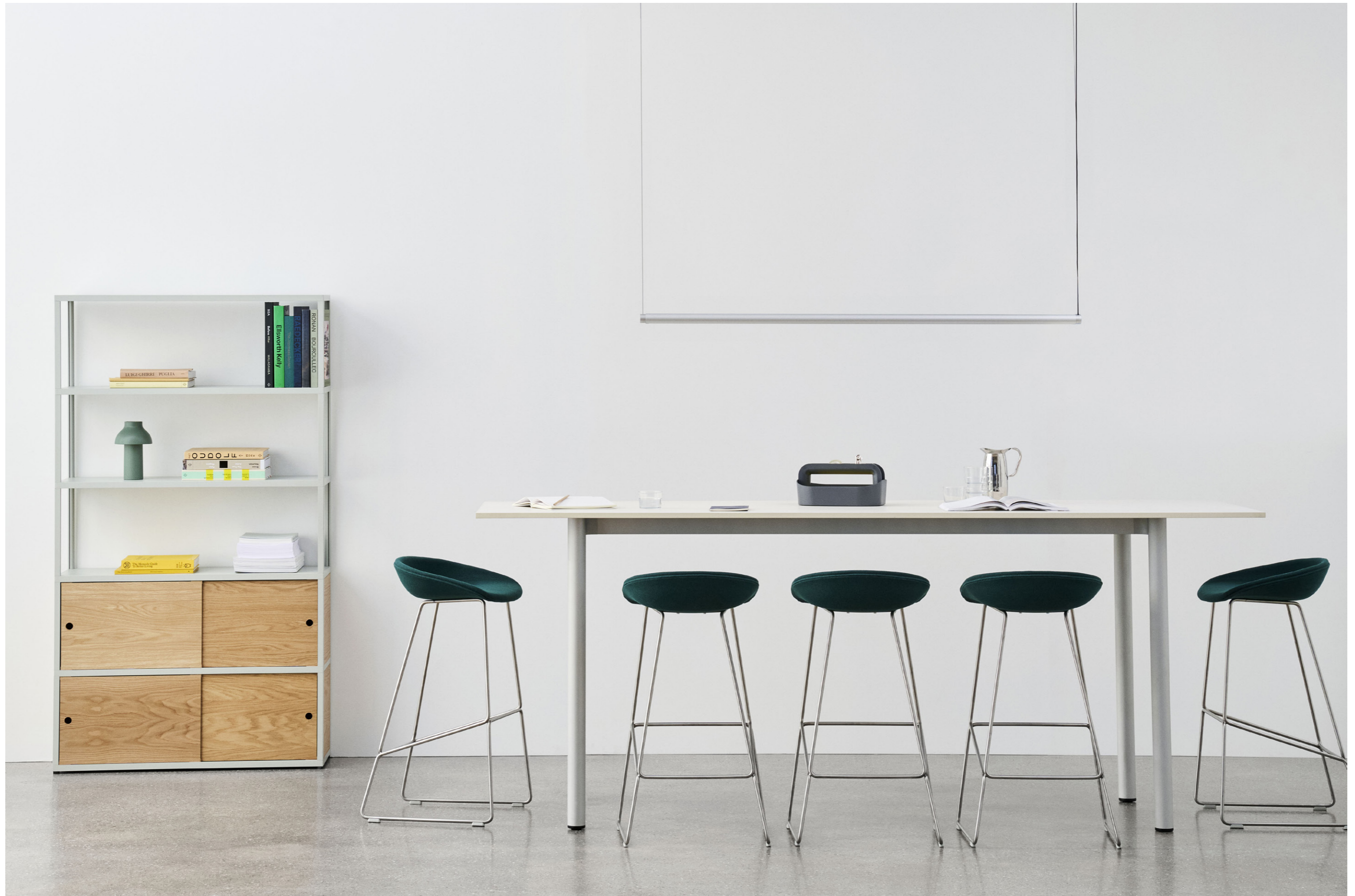
AAS 39 | Autumn 0971 | Stainless steel base