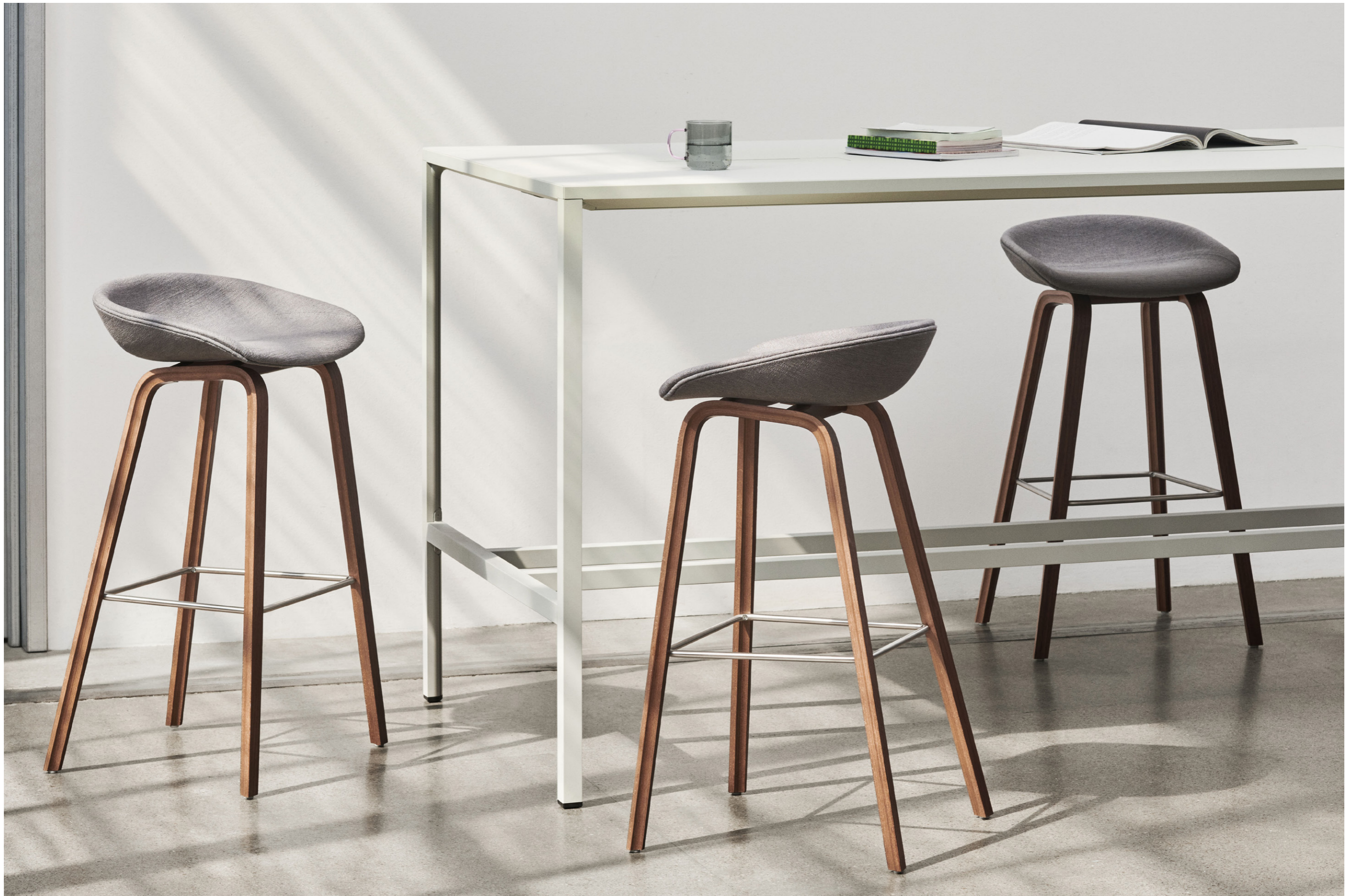
AAS 33 High | Ruskin 12 | Water-based lacquered walnut base