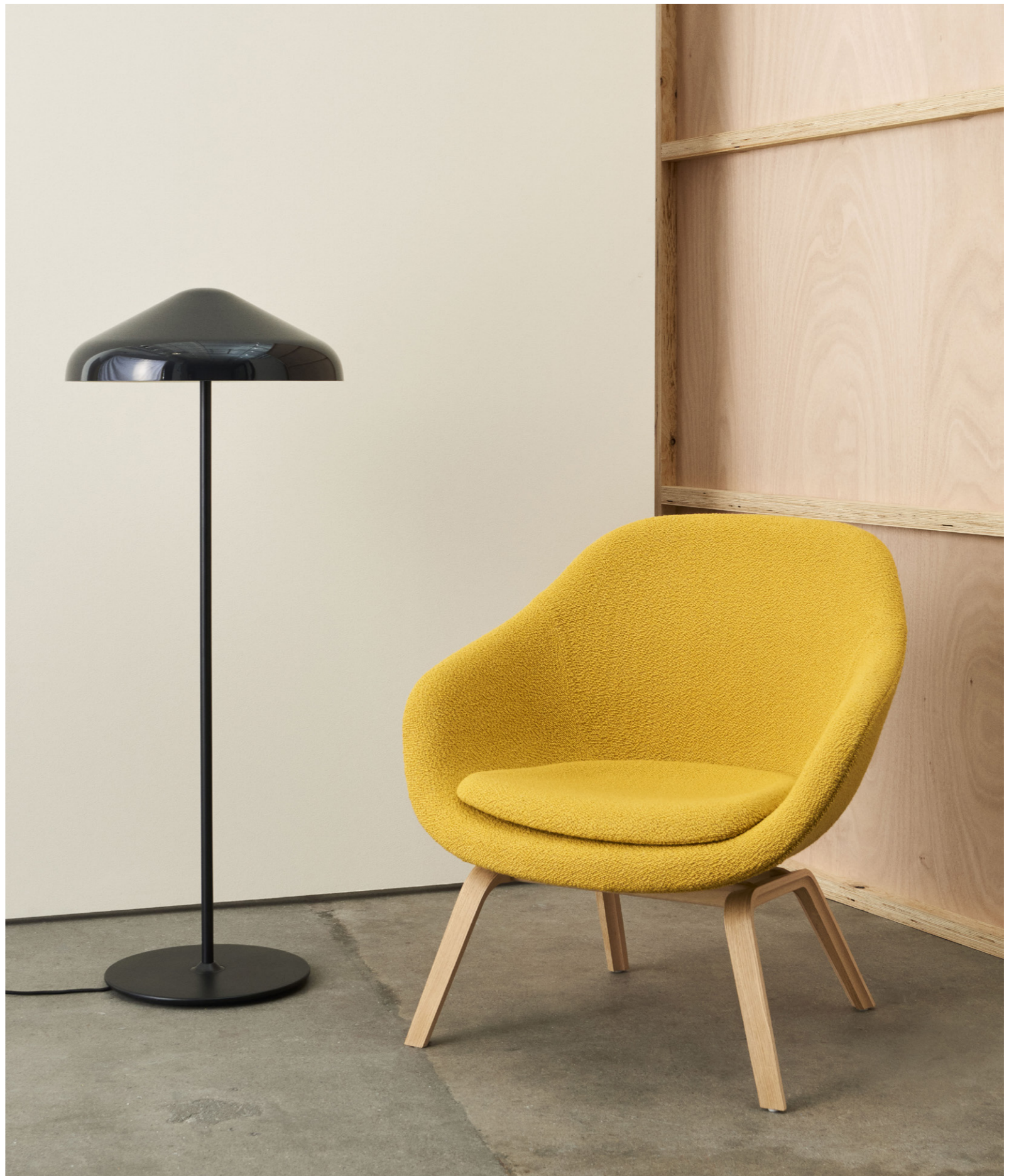
AAL 83 | Flamiber Mimosa E9 | Water-based lacquered oak base