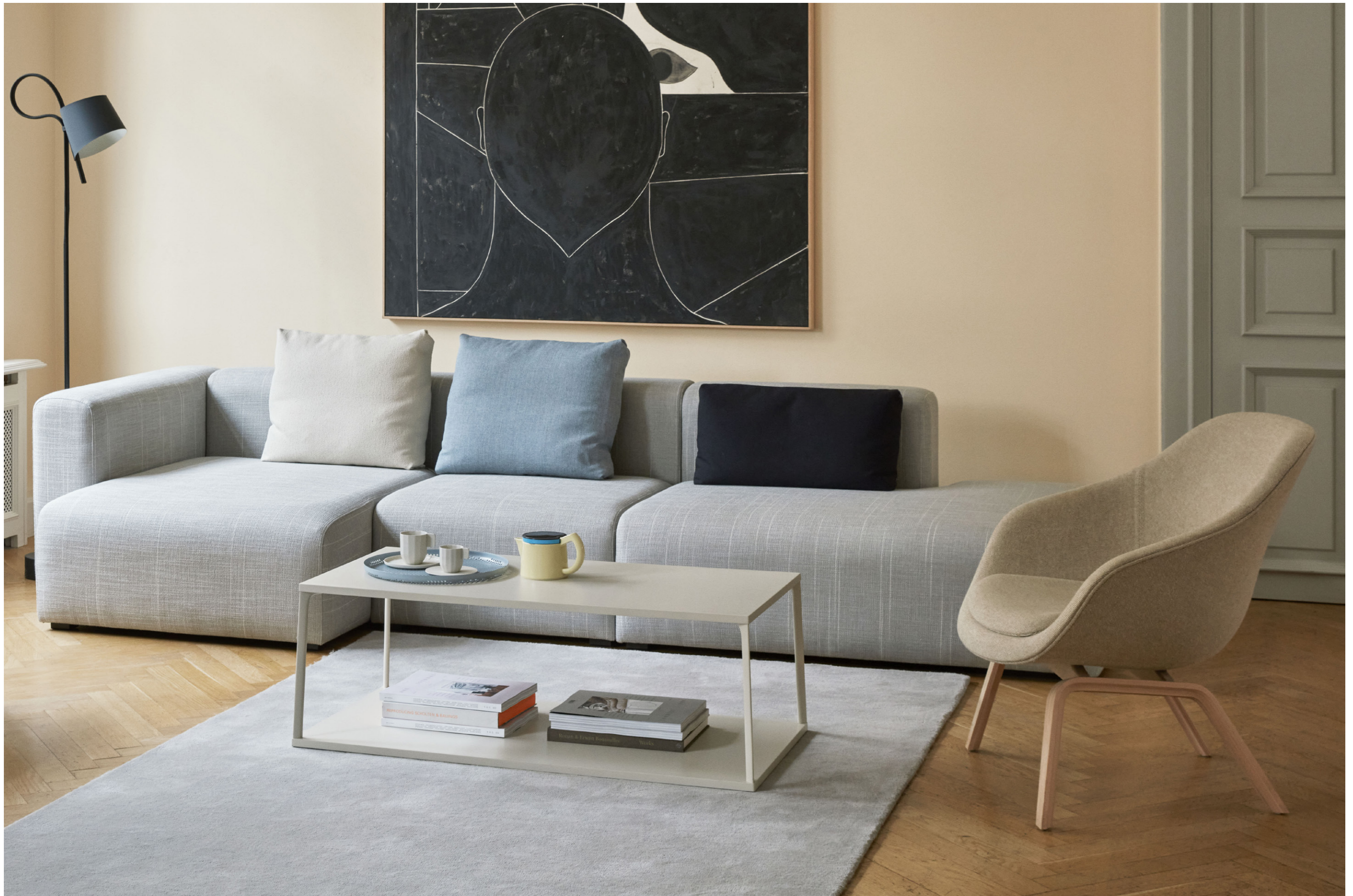
AAL 83 | Hallingdal 220 | Water-based lacquered oak base