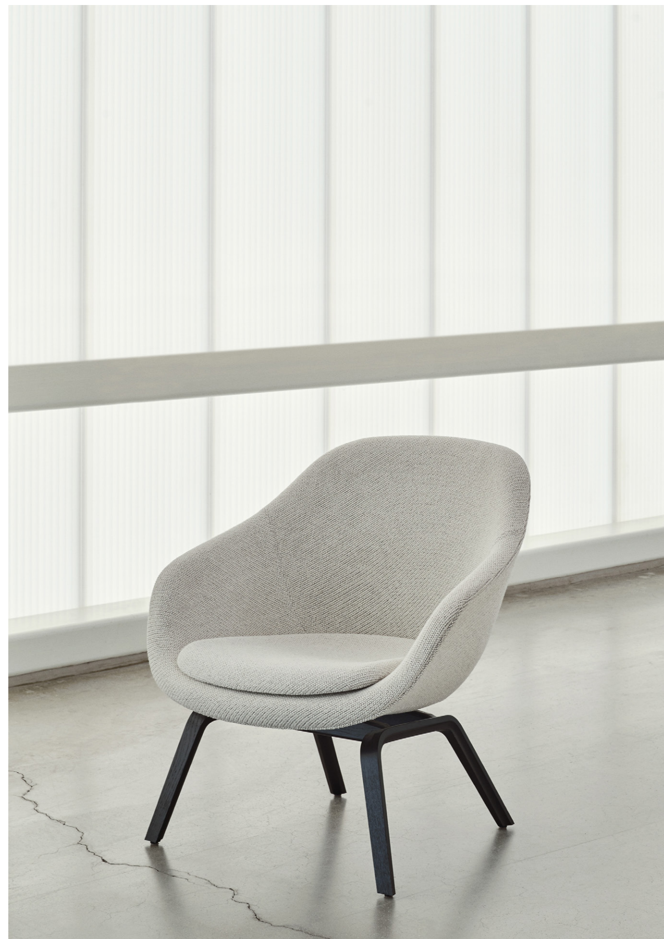
AAL 83 | Coda 100 | Black water-based lacquered oak base