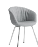
AAC 27 Soft