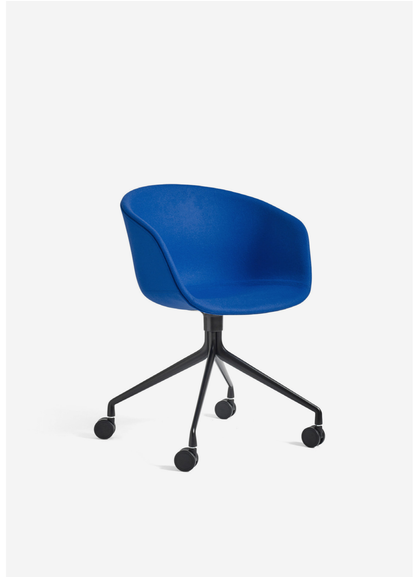
AAC 25 | Divina 756 | Black powder coated aluminum base