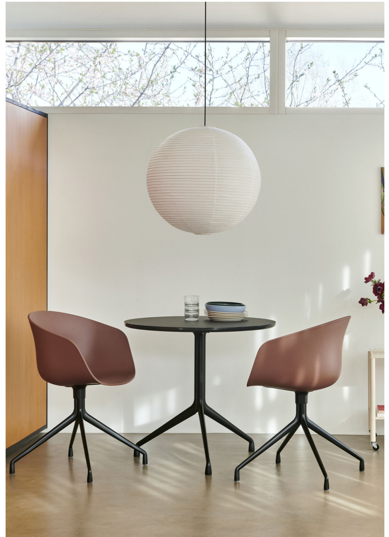
AAC 20 | Soft brick shell | Black aluminium base