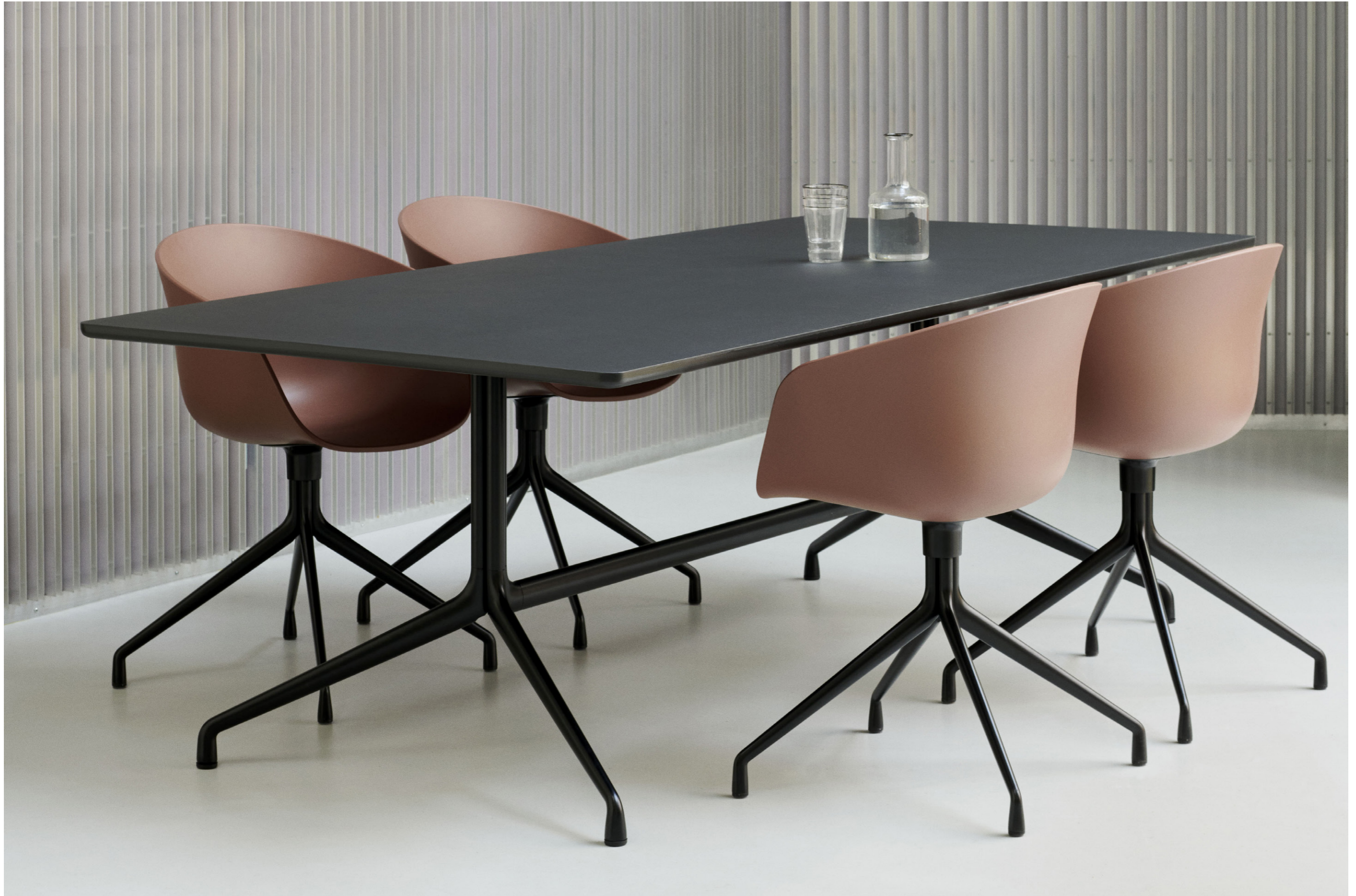
AAC 20 | Soft brick shell | Black aluminium base