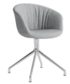
AAC 21 Soft