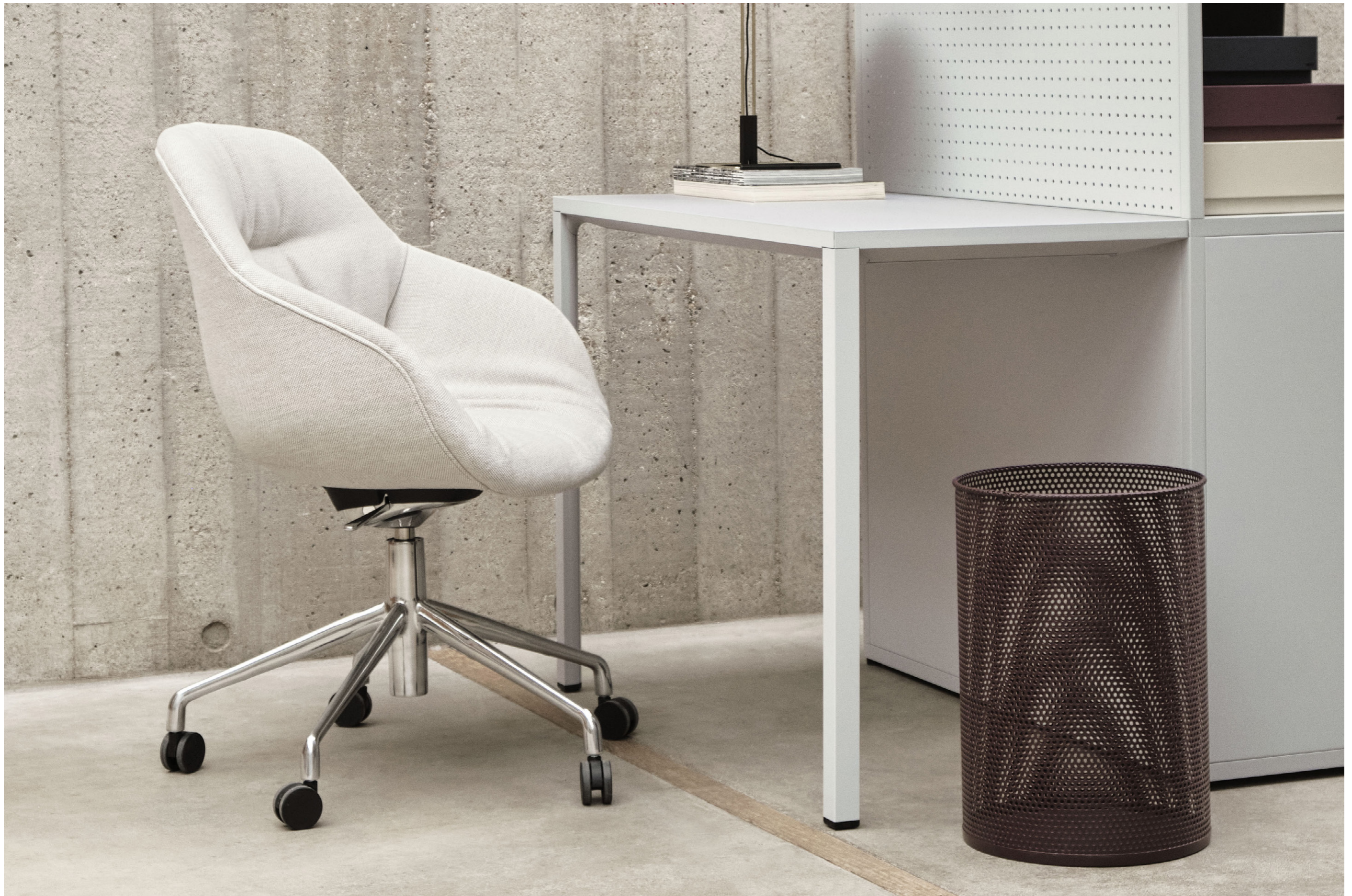
AAC 155 Soft | Mode 009 | Polished aluminium tilt base