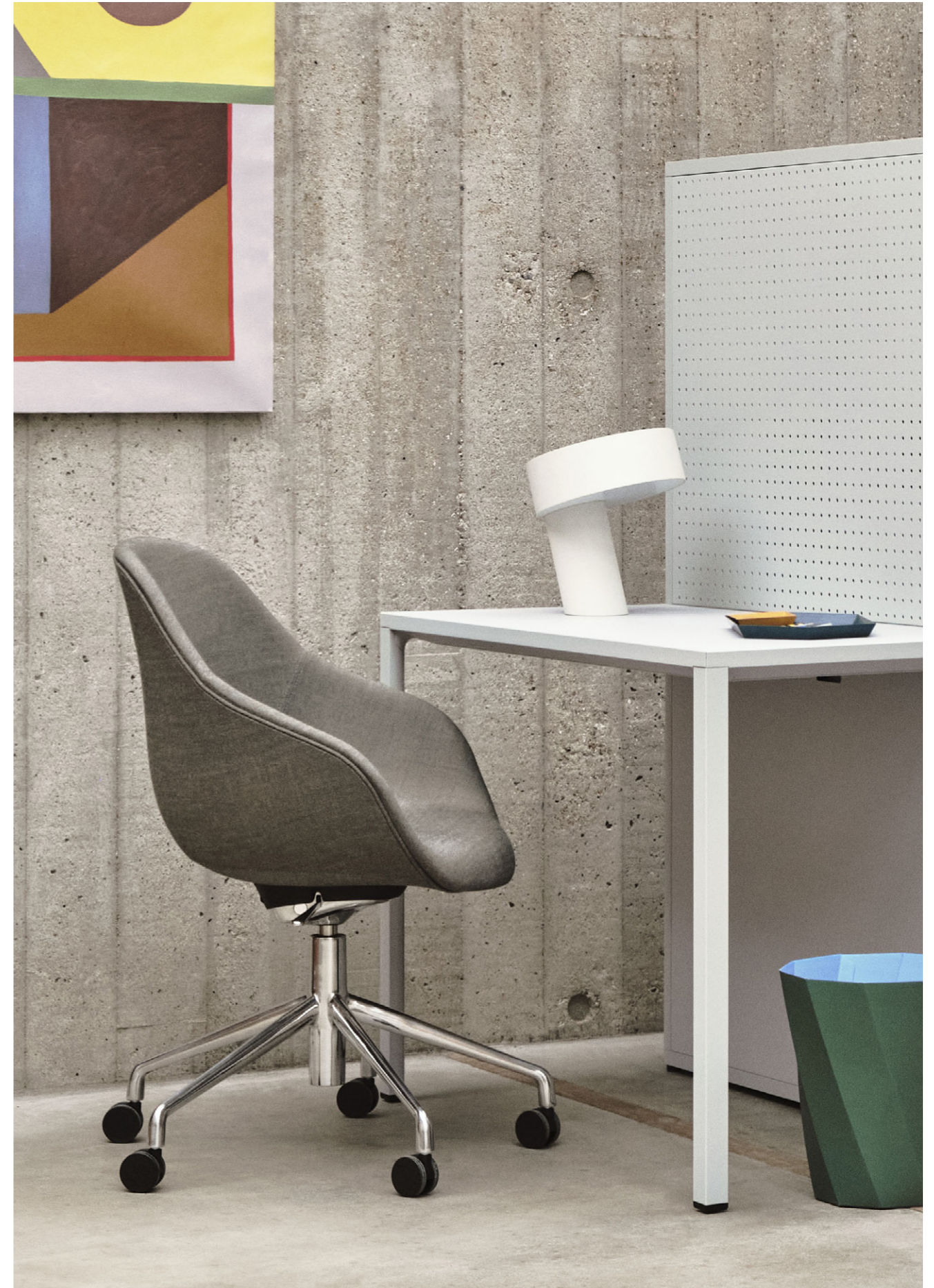
AAC 155 | Atlas 931 | Polished aluminium tilt base