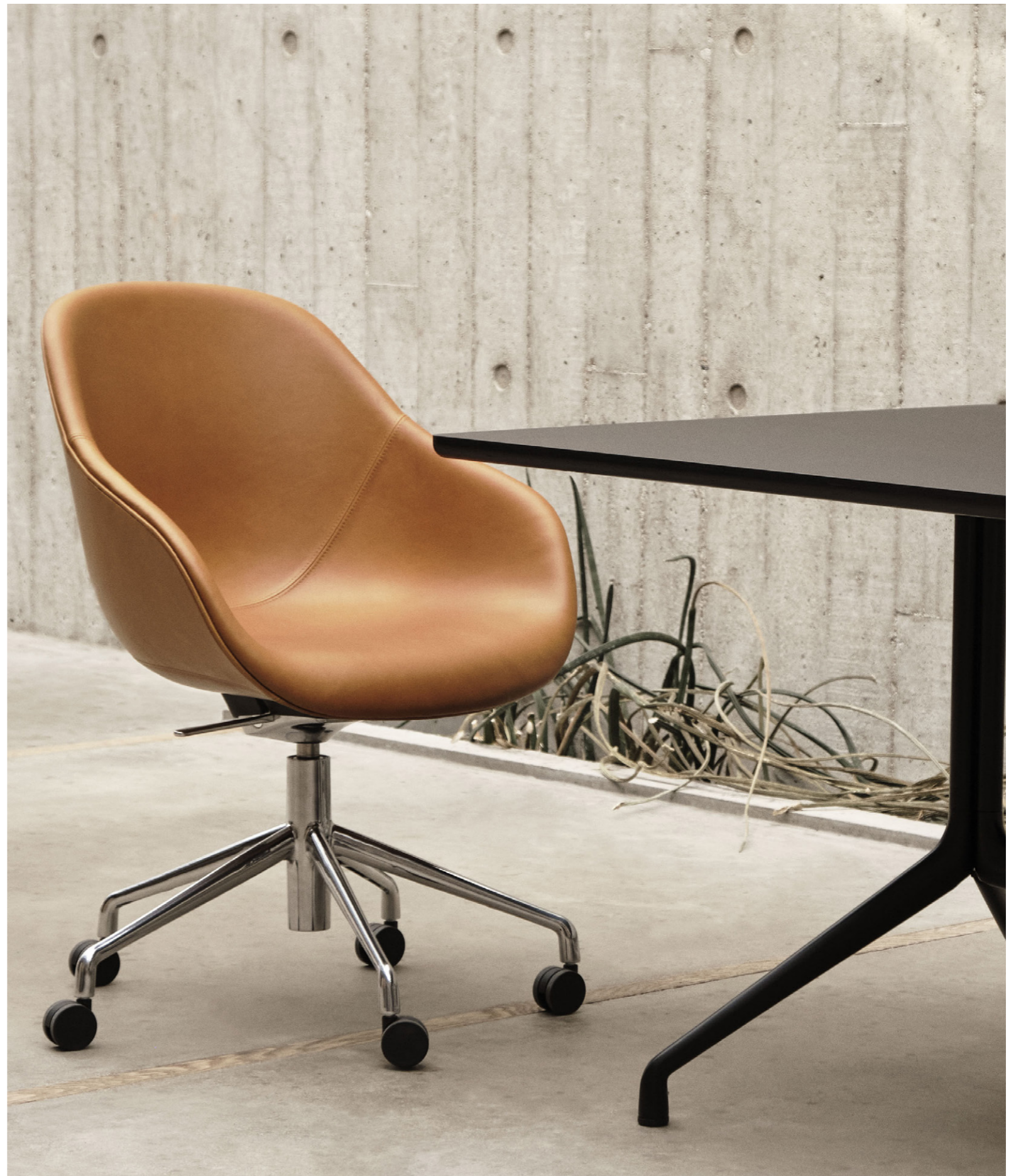
AAC 155 | Sense cognac | Polished aluminium tilt base