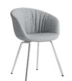
AAC 27 Soft