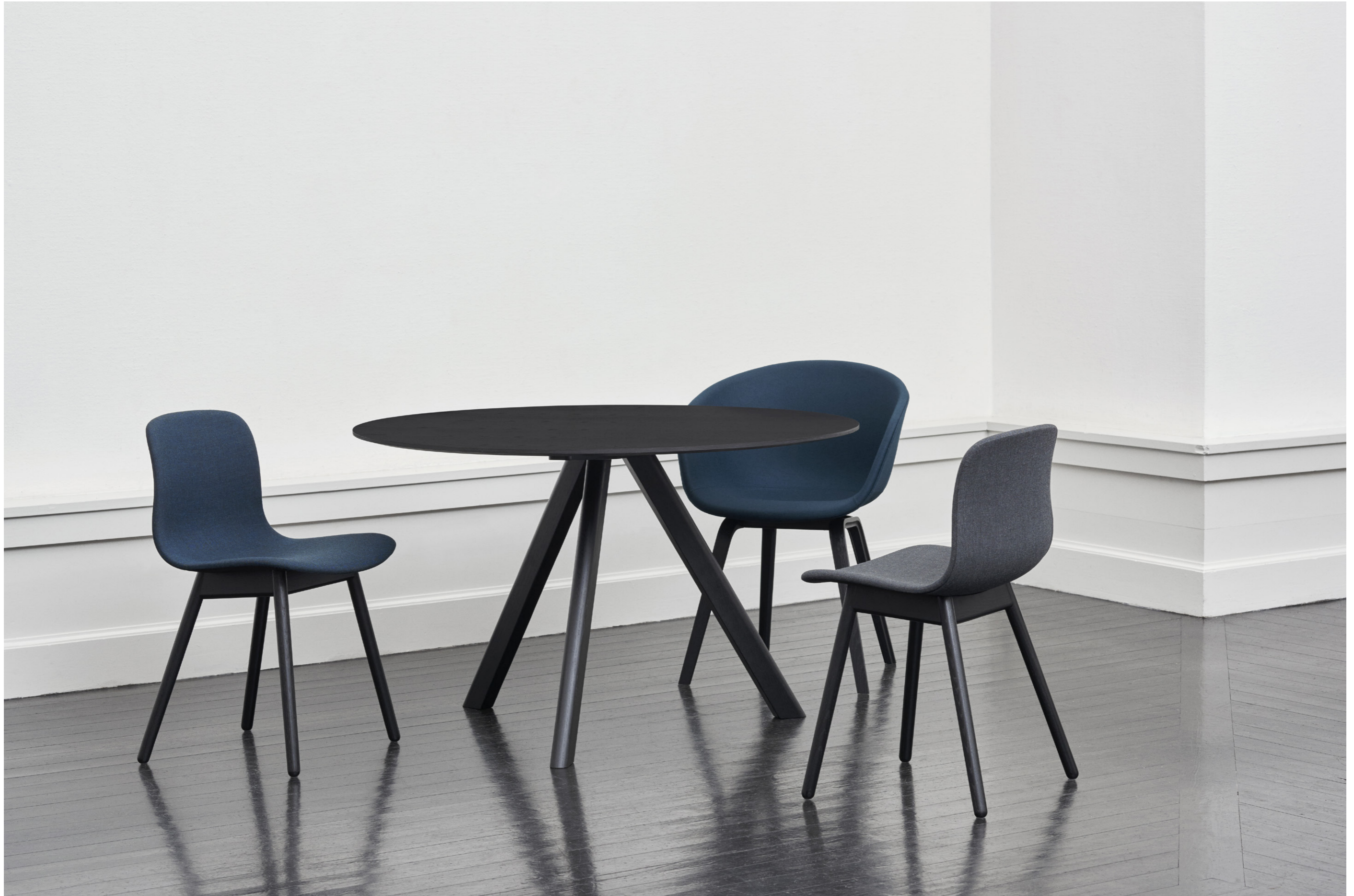
AAC 13 | Remix 873 | Black water-based lacquered oak base AAC 13 | Remix 163 | Black water-based lacquered oak base