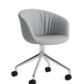
AAC 25 Soft