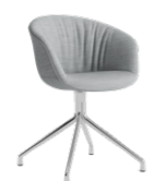
AAC 21 Soft