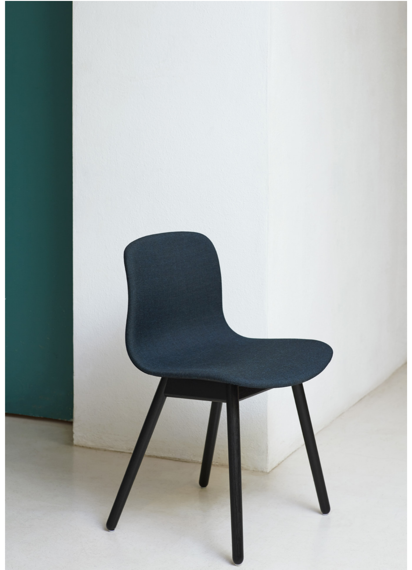
AAC 13 | Remix 873 | Black water-based lacquered oak base