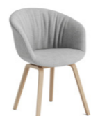
AAC 23 Soft