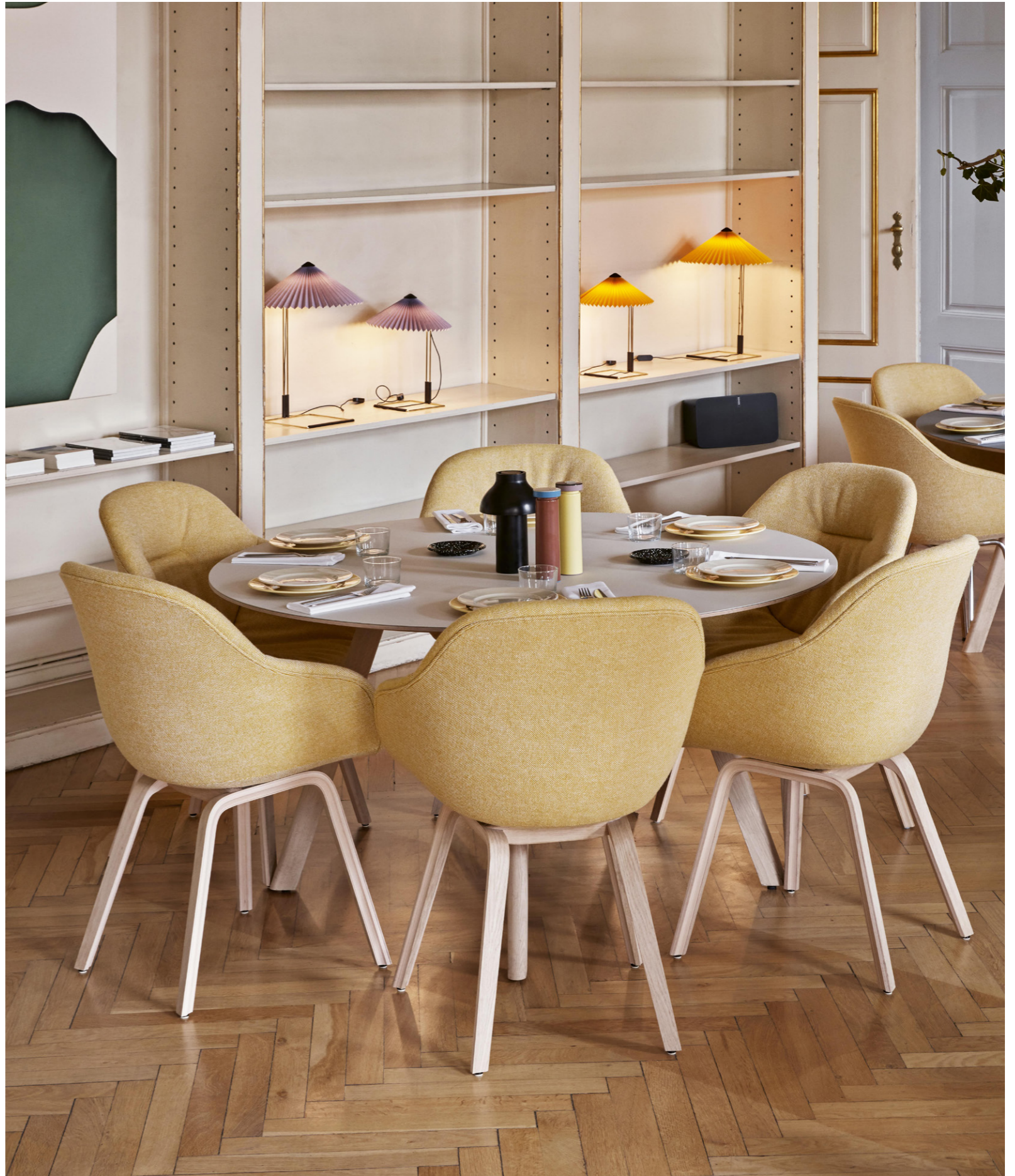
AAC 123 Soft | Hallingdal 407 | Water-based lacquered oak base