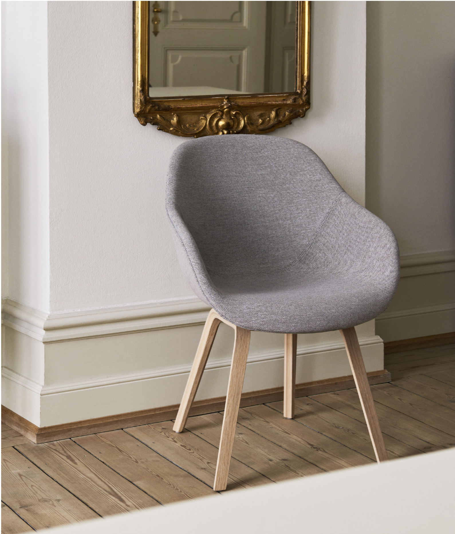
AAC 123 | Mode 008 | Water-based lacquered oak base