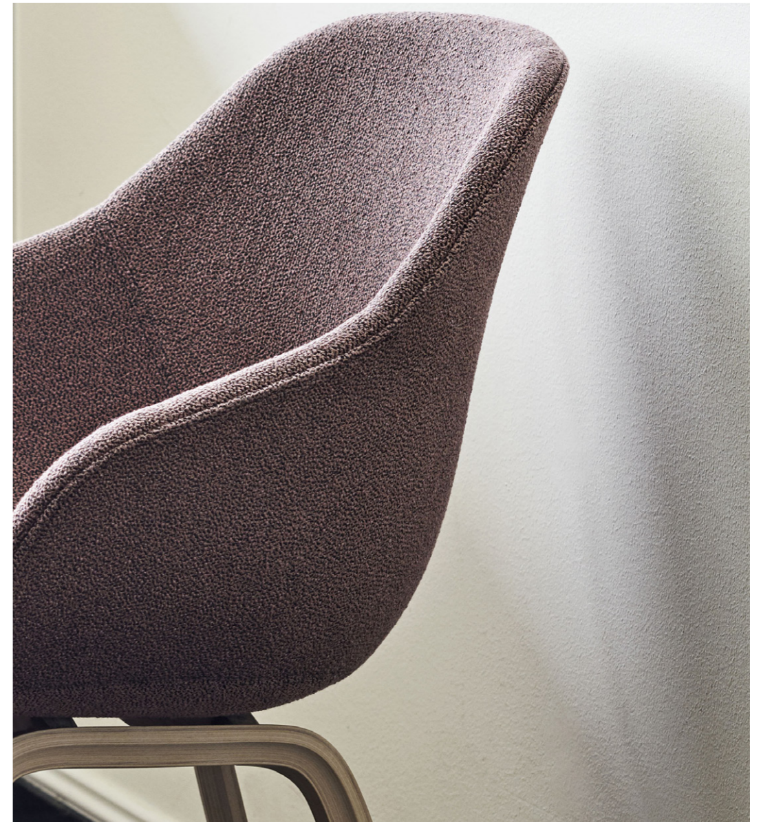
AAC 123 | Olavi by HAY 12 | Water-based lacquered oak base