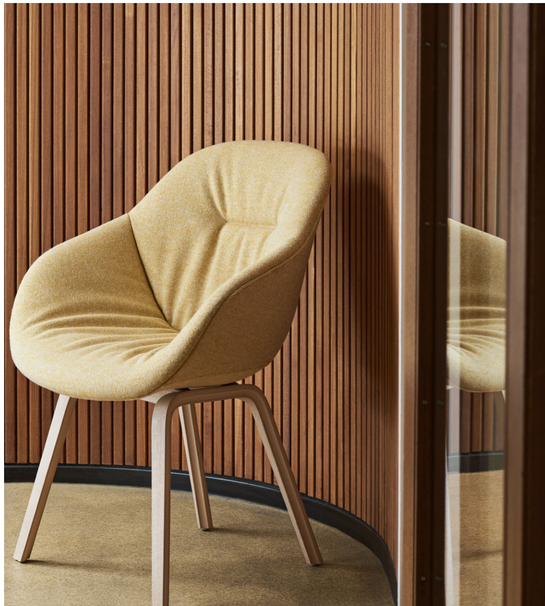
AAC 123 Soft | Hallingdal 407 | Water-based lacquered oak base