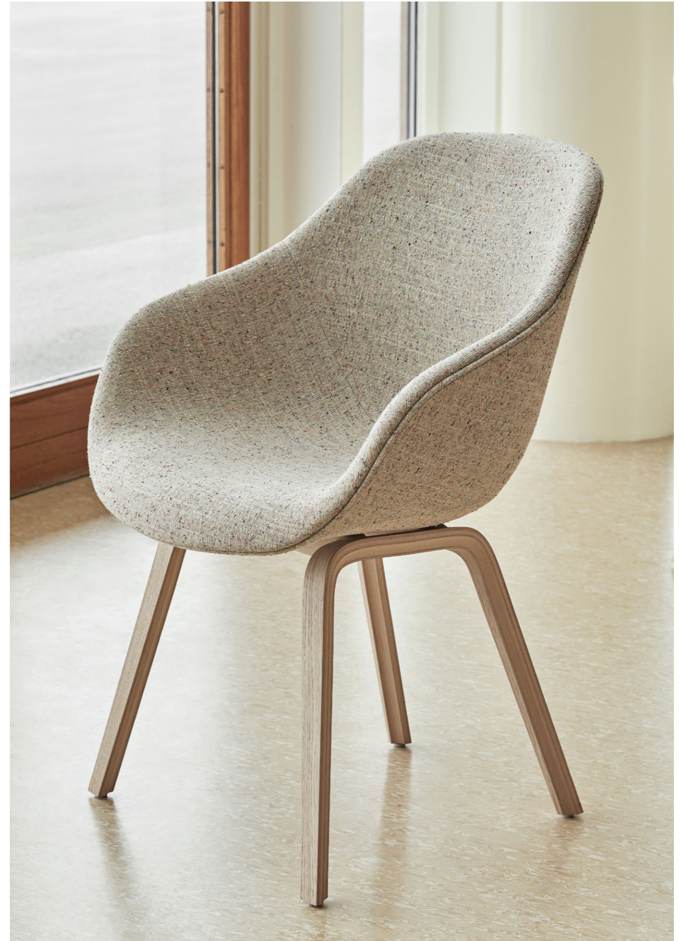
AAC 123 | Bolgheri LGG60 | Water-based lacquered oak base