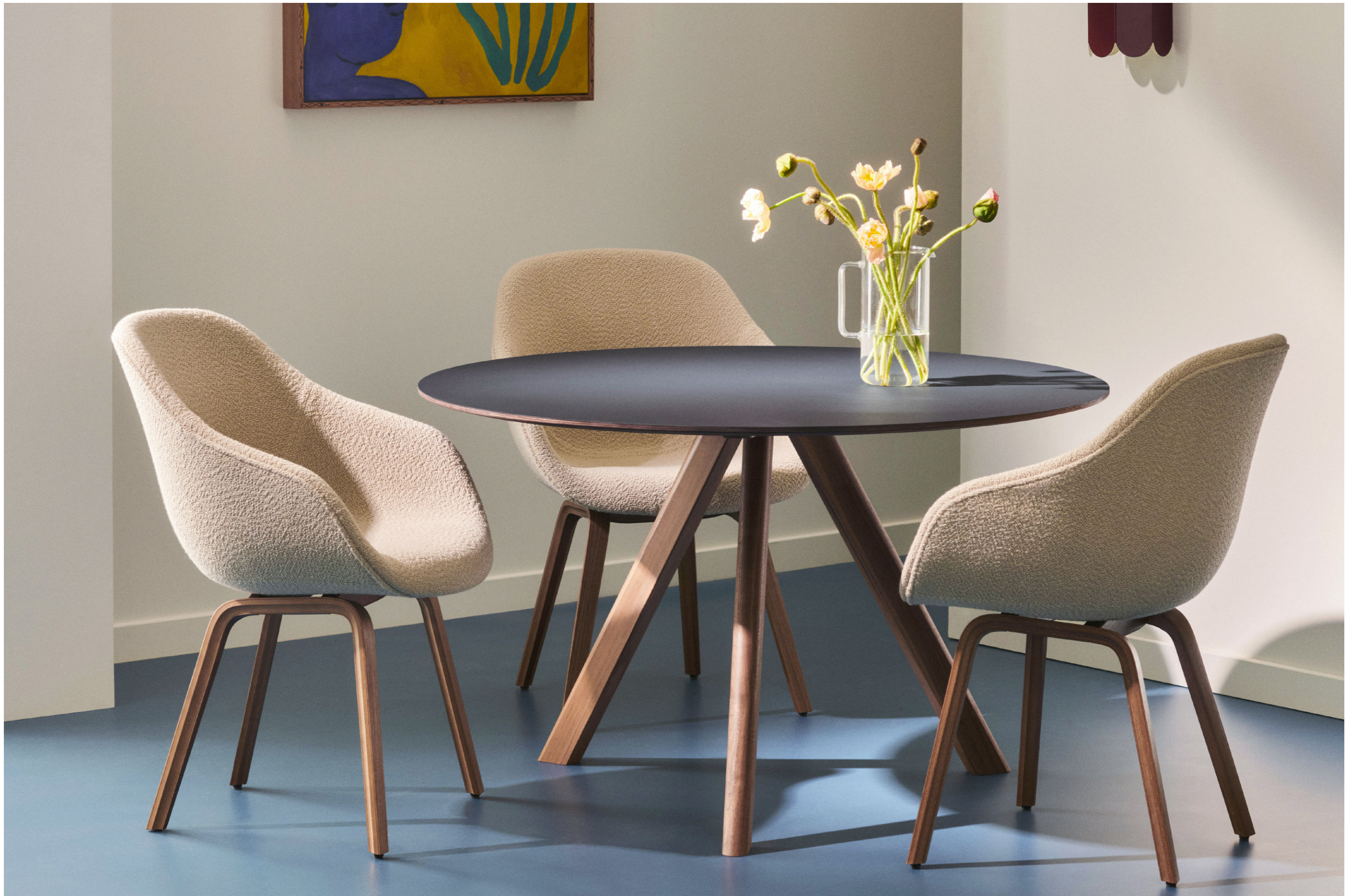
AAC 123 | Flamiber J7 sand | Water-based lacquered walnut base