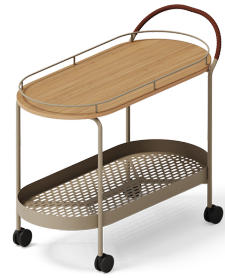
Latte RAL 1019