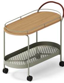
Forest Green RAL 7033