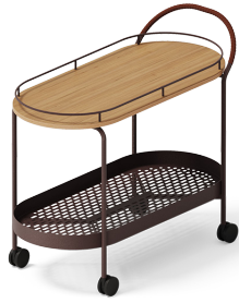
Coffee RAL 8019