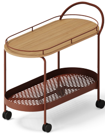
Copper Brown RAL 8004