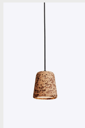
Item No: 20111 / 20111US Variant: Mixed Cork