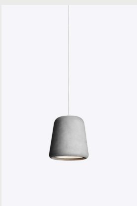
Item No: 20115 / 20115US Variant: Light Grey Concrete