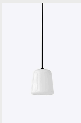
Item No: 20124 / 20124US Variant: White Opal Glass