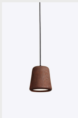
Item No: 20113 / 20113US Variant: Smoked Oak