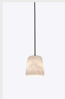
Item No: 20123 / 20123US Variant: The Black Sheep (White Marble)