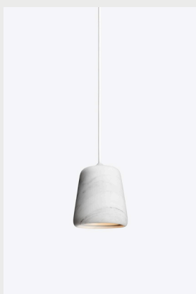
Item No: 20119 / 20119US Variant: White Marble