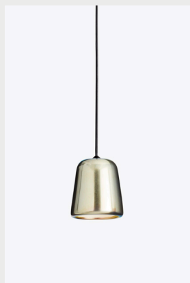
Item No: 20121 / 20121US Variant: Yellow Steel