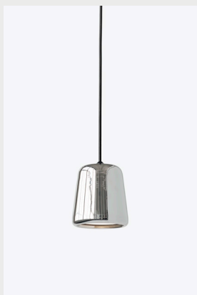
Item No: 20125 / 20125US Variant: Stainless Steel