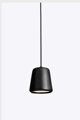
Item No: 20118 / 20118US Variant: Black Marble