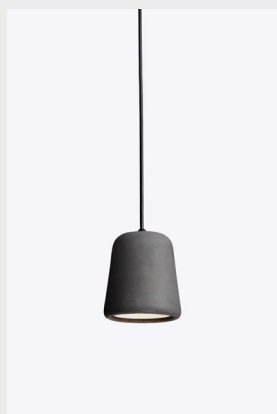
Item No: 20117 / 20117US Variant: Dark Grey Concrete