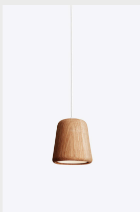
Item No: 20112 / 20112US Variant: Natural Oak