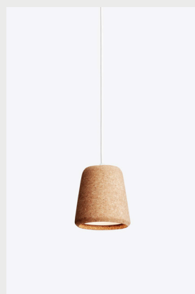
Item No: 20110 / 20110US Variant: Natural Cork