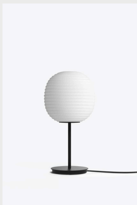
Item No: 20611 Variant: Lantern Table Lamp, Small