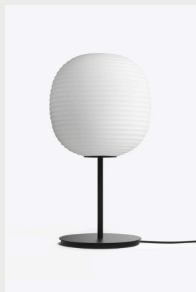
Item No: 20621 Variant: Lantern Table Lamp, Medium